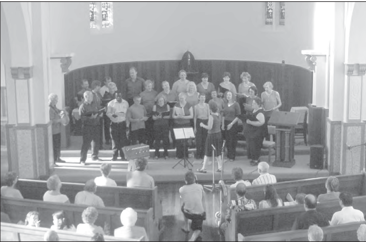
The Bouddi Voice Choir Will sing at the St Joseph's Convent Chapel