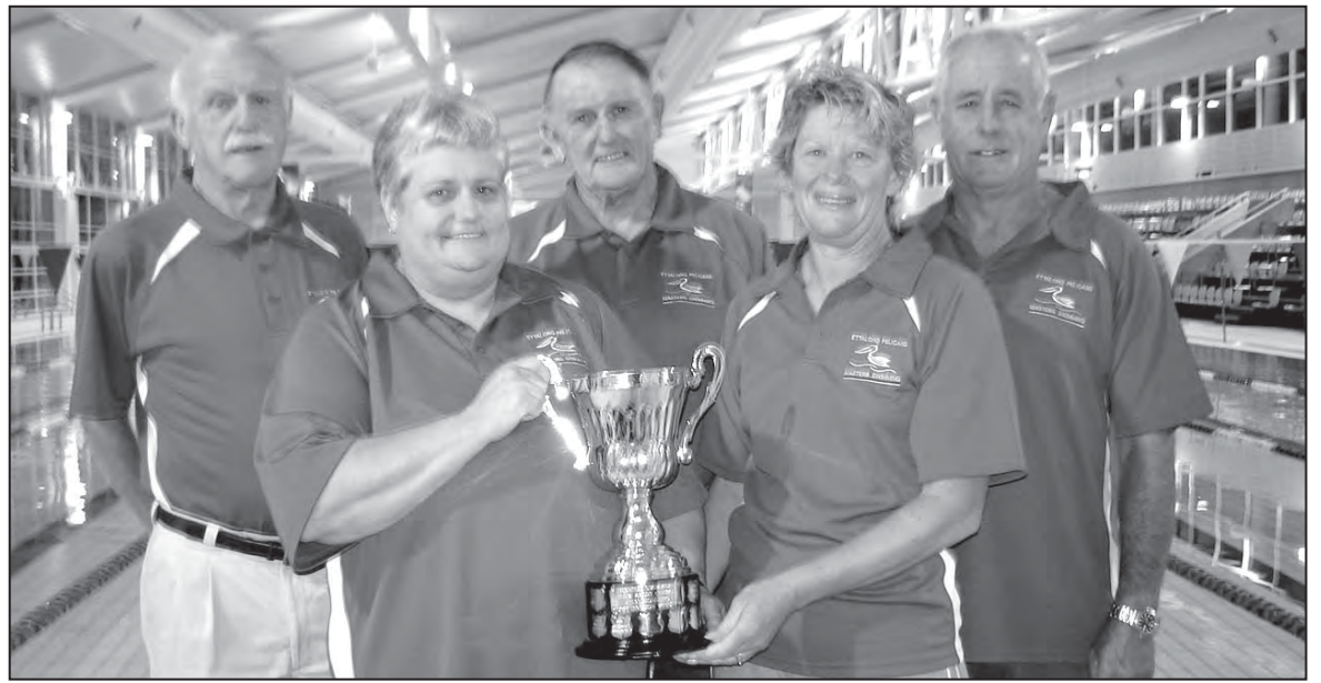
Ettalong Pelicans swimmers with championship trophy