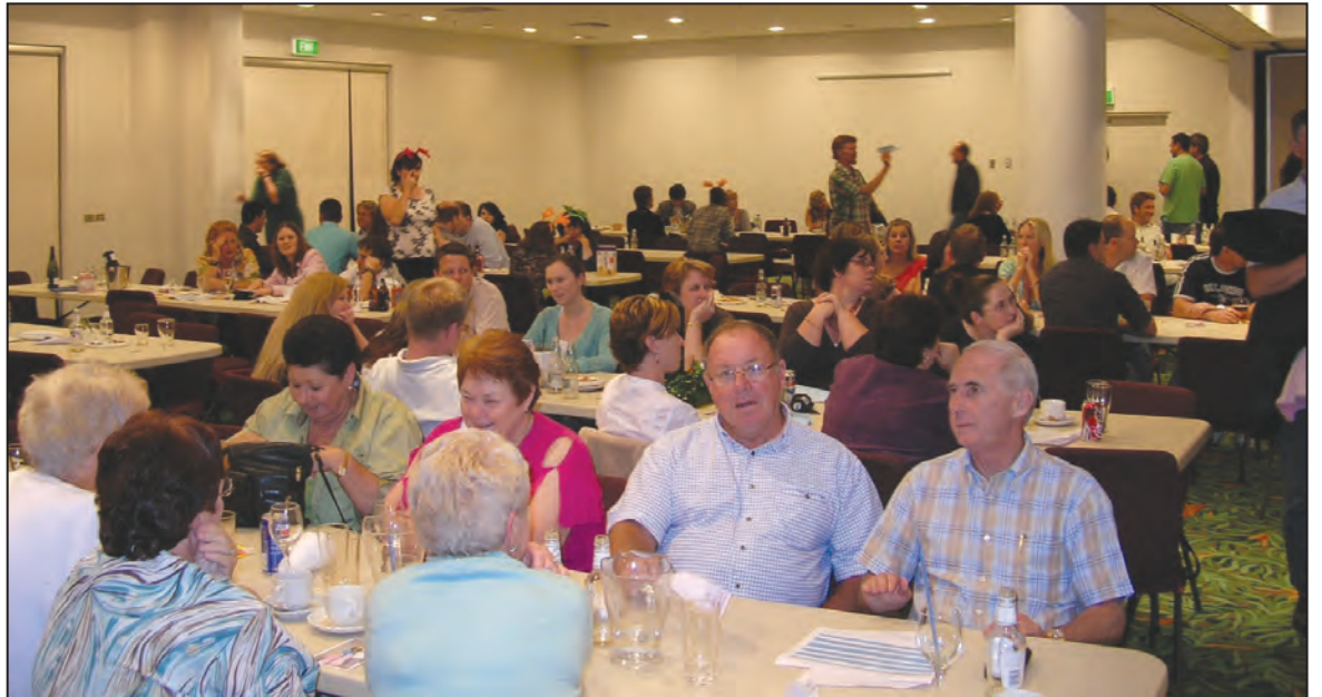
Participants at the recent trivia night at the Ettalong War Memorial Club