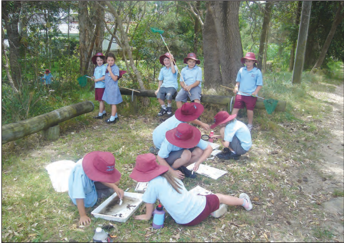
Umina Public School students check stream water for bugs