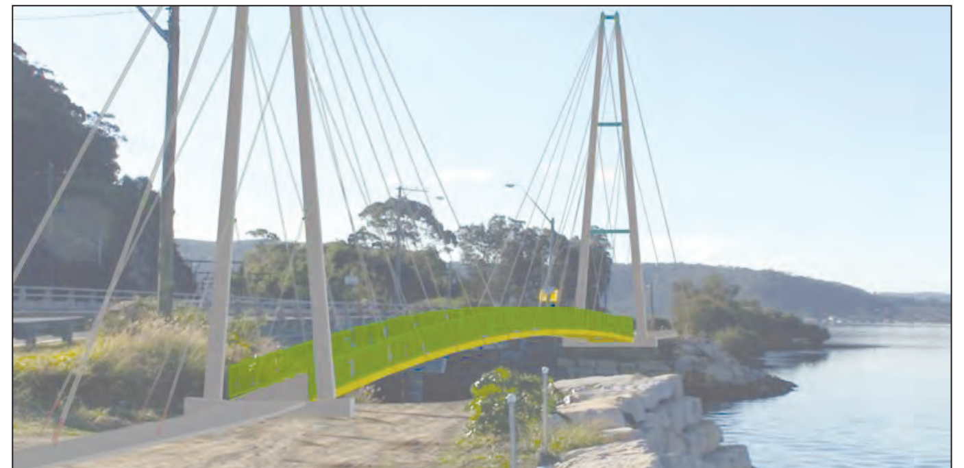
An artist's impression of the bridge