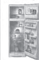
FRIDGES & FREEZERS