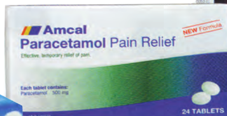
Amcal Paracetamol Pain Relief 24 Tablets $1 95

take up the challenge to beat cold and flu