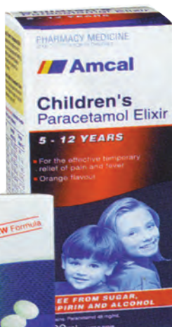
Amcal Children's Paracetamol Elixir - 5-12 years $11 95