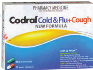
Codral Cold & Flu + Cough 48 Capsules $17 95