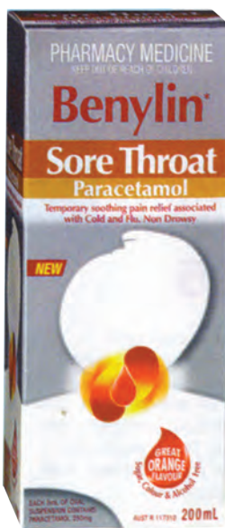
Benylin Sore Throat Liquid 200mL $12 95