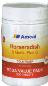
Amcal Horseradish & Garlic Plus C Mega Pack 200 Tablets 2 for $39 50