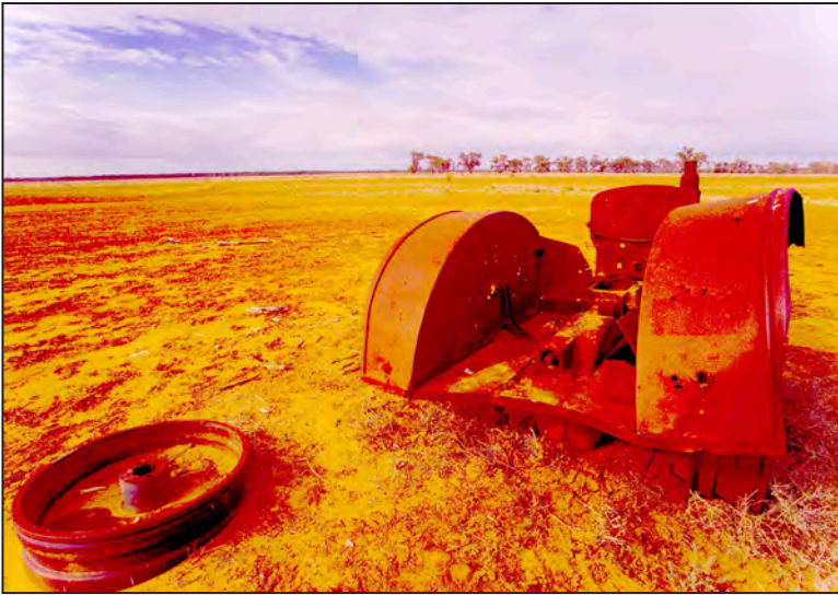
Out of Lightning Ridge by Dawne Fahey