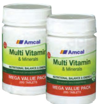
Amcal Multi Vitamin & Minerals Mega Pack 200 Tablets 2 for $19 95

take our advice before you take anything else