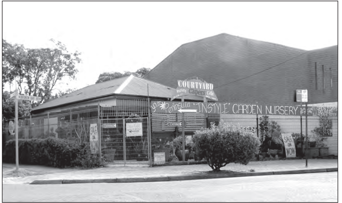
Courtyard Capers at Ettalong