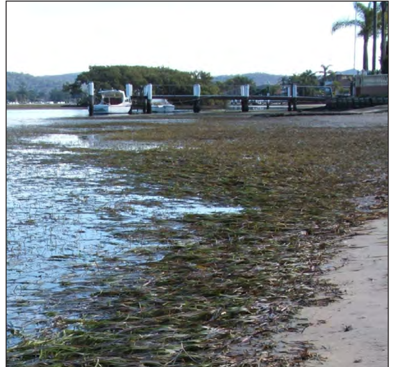
Seagrass at Shelter Cove, St Huberts Island