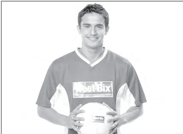
You can win soccer gear signed by Tim Cahill