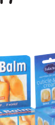
Eulactol Hand Balm 100ml, Cream 125mL, Heel Balm 50g or Cuticle and Nail Cream 20g $7 95 Each