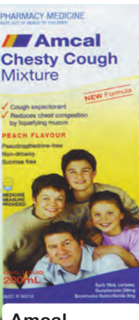
Amcal Cough Suppressant Chesty Cough Mixture or Junior Decongestant Mixture 200mL $14 95 Each