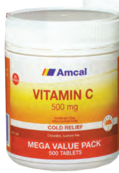
Amcal Vitamin C 500mg Mega Pack 500 Tablets 2 for $28 50