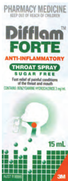
Diffiam Forte Throat Spray 15mL $10 95