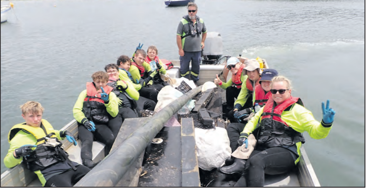
"The small Mangrove Island had a full bag of small litter plus poly pipe and oyster baskets."

"There were plenty of bait bags, plastic bottles, food wrappings,\ and rubber items collected today in the small litter.