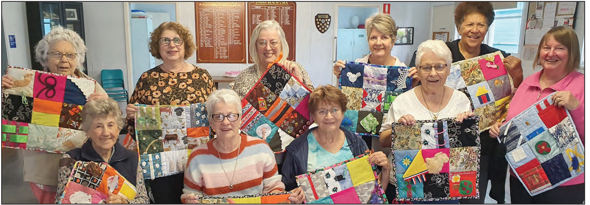
The craft group at the Umina Beach branch of the Country Women's Association have put together a set of "fidget mats".

The mats will be donated to Peninsula Village for use by residents with dementia.