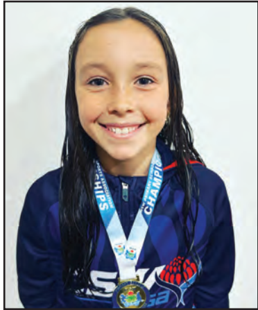
top six girls from each state within Australia.

SOURCE: Media release, 31 Jul 2024 Kentrelle Glynn, Umina