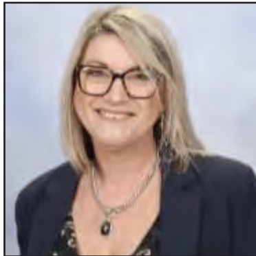
She said she was confident that, with their support, they could create a positive and inspiring educational experience for every child at Woy Woy Public School.

"I look forward to working in partnership with parents and carers and value open communication."