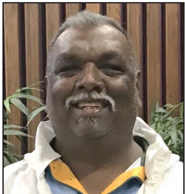
25 Everglades Mens Major Singles Champion."