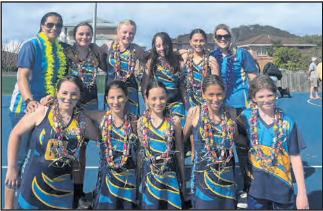
FLYERS-Jun Blue Runners-up 2022