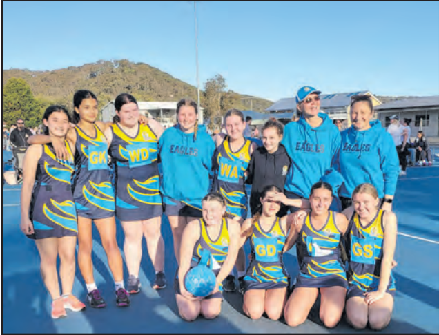
OSPREY-IJ Blue Premiers 2022