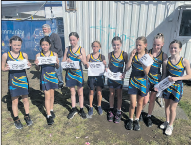
AQUILA-IJ White Runners-up 2022