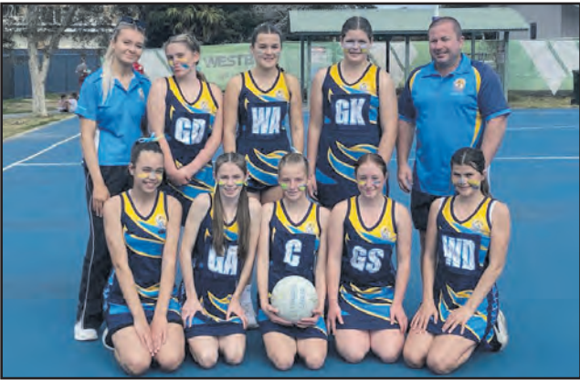
CARAWAS-IJ Green Runners-up 2022

Ettalong Eagles Netball Club has had five teams play in the grand finals, with two teams crowned premiers.