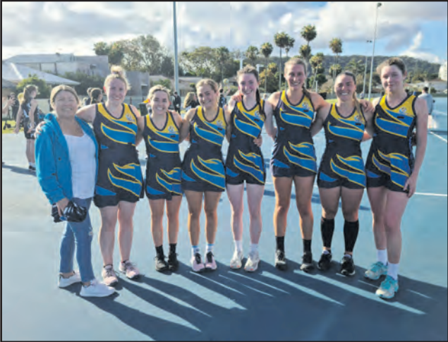
SPIRIT- Senior Blue Premiers 2022