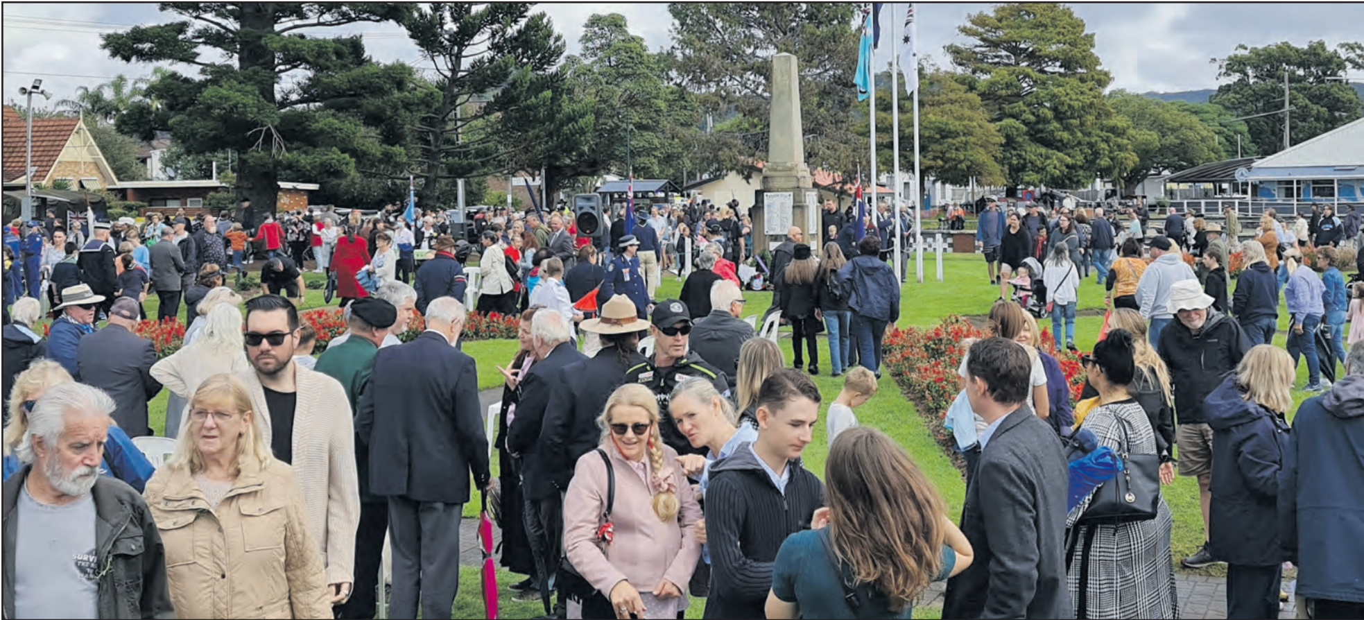
A large crowd attended the Anzac Day ceremony in Woy Woy