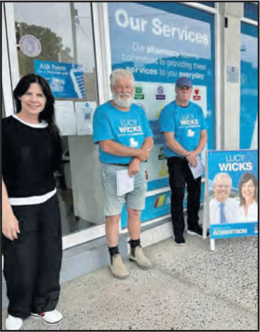
Lucy Wicks has been on the hustings in Woy Woy and Umina over the past two weeks. DETAILS: Page two

SOURCE: Social media, 12 Nov 2021 Lucy Wicks, Member for Robertson