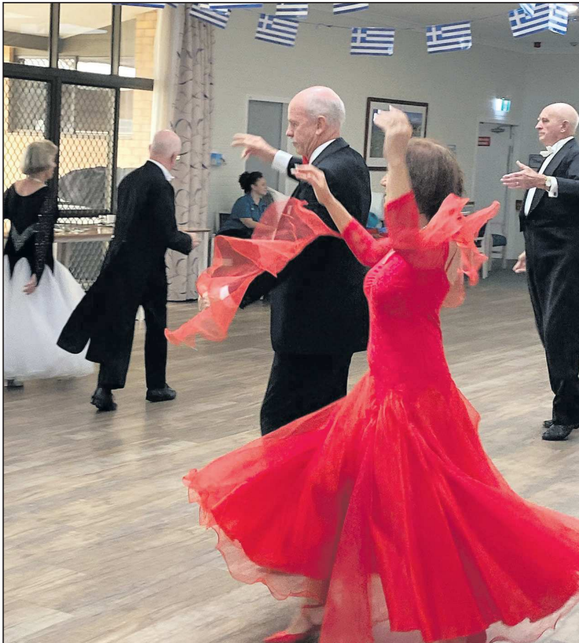
It was Greek Theme day at Blue Wave Living aged care on Thursday, March 25, when they had a concert where they dressed up for a dance.