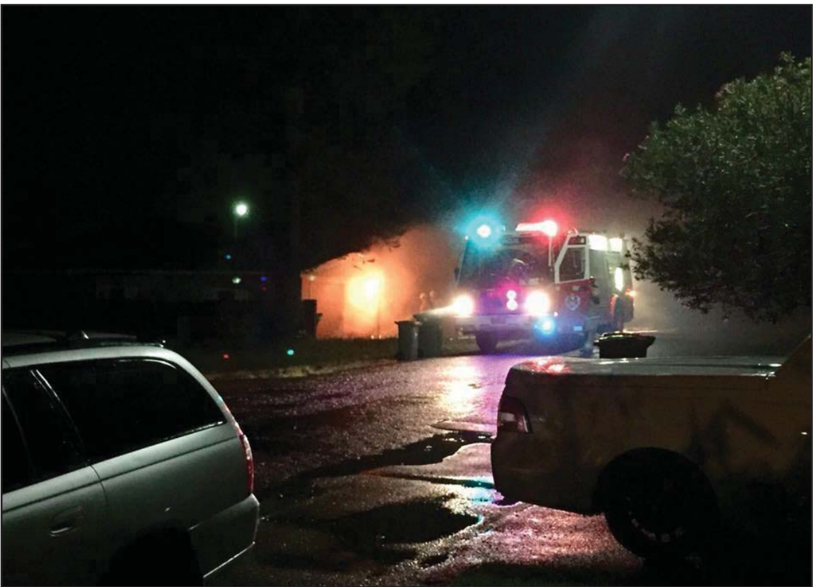
Fire and rescue vehicles attended the garage fire caused by a lightning strike