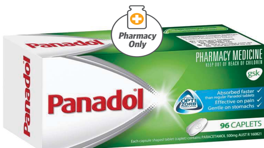
PANADOL Optizorb 96 Caplets*