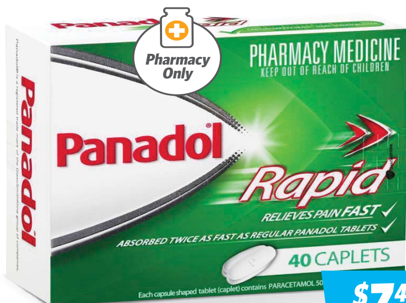
PANADOL Rapid 40 Caplets*