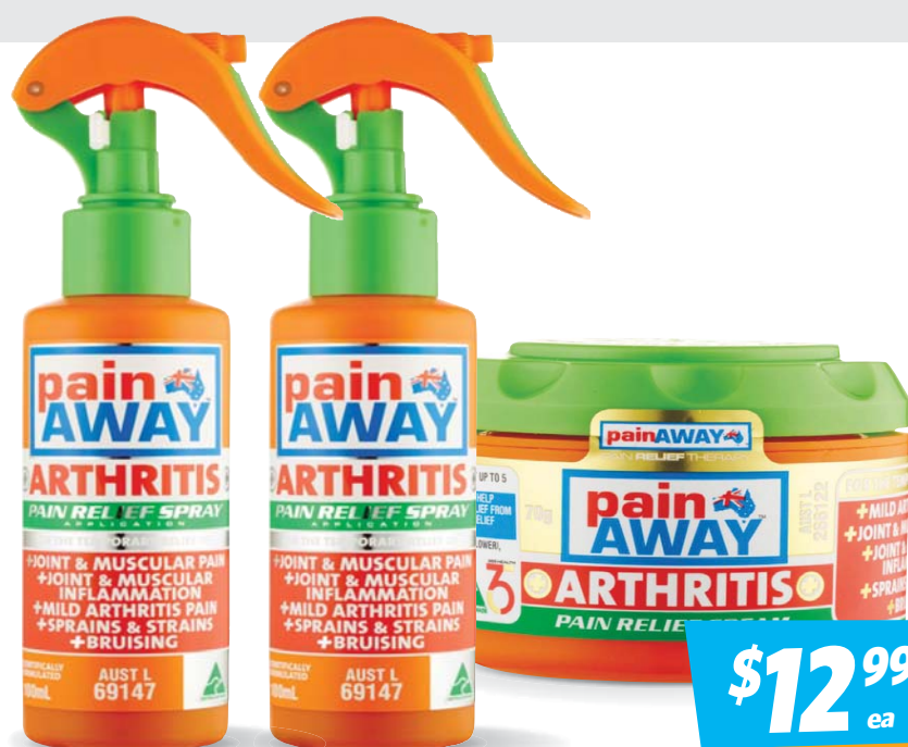
PAIN AWAY Arthritis Pain Relief Cream and Spray*