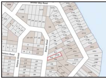
Item 215 Booker Bay Cemetery Site, 44 and 44A Bogan Road, Booker Bay