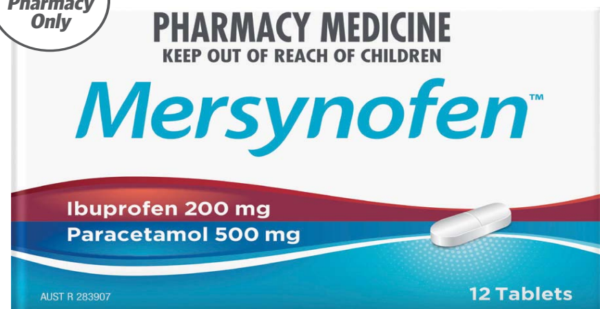
MERSYNOFEN 12 Tablets*