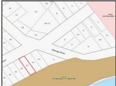
Item 260 Garage, 17 Bay Street, Patonga