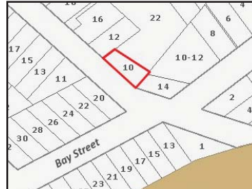
Item 263 The Old School House, 10 Jacaranda Avenue, Patonga