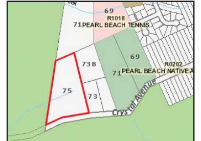
Item 268 Crommelin Biological Research Station, 75 Crystal Avenue, Pearl Beach