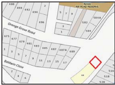
Item 214 Blackwall Mountain Sandstone Block, Governor Phillip Memorial Park, Rip Bridge, Booker Bay