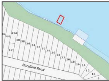
Item 245 Boatshed, Melita, 28 Horsfield Road, Horsfield Bay