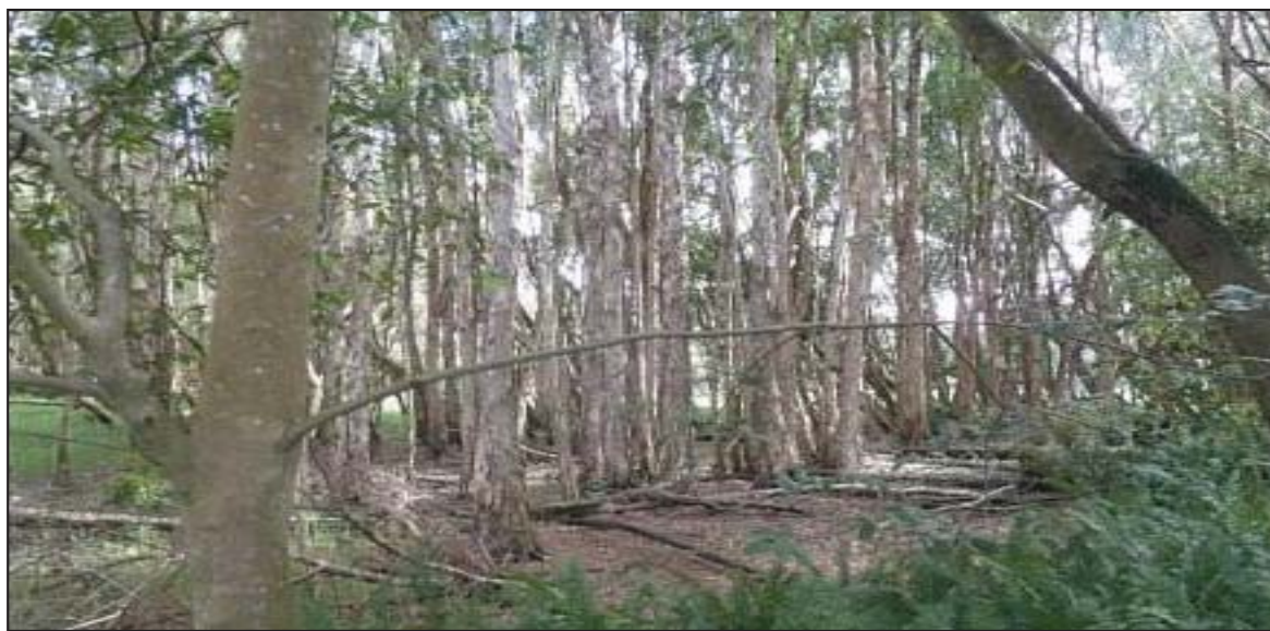
Melaleuca forest within the Everglades camp

"Approximately 82 per cent of forested land within 20km of