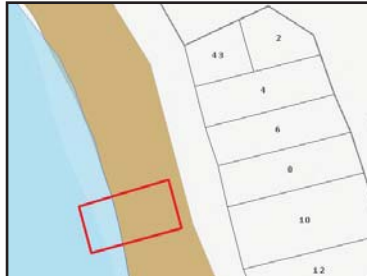
Item 262 Bushfire Brigade Headquarters, Fire Boatshed, Patonga Creek Reserve, end of Jacaranda Avenue