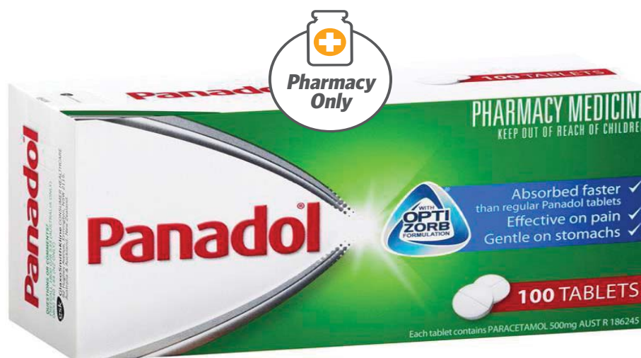
PANADOL Optizorb 100 Tablets*