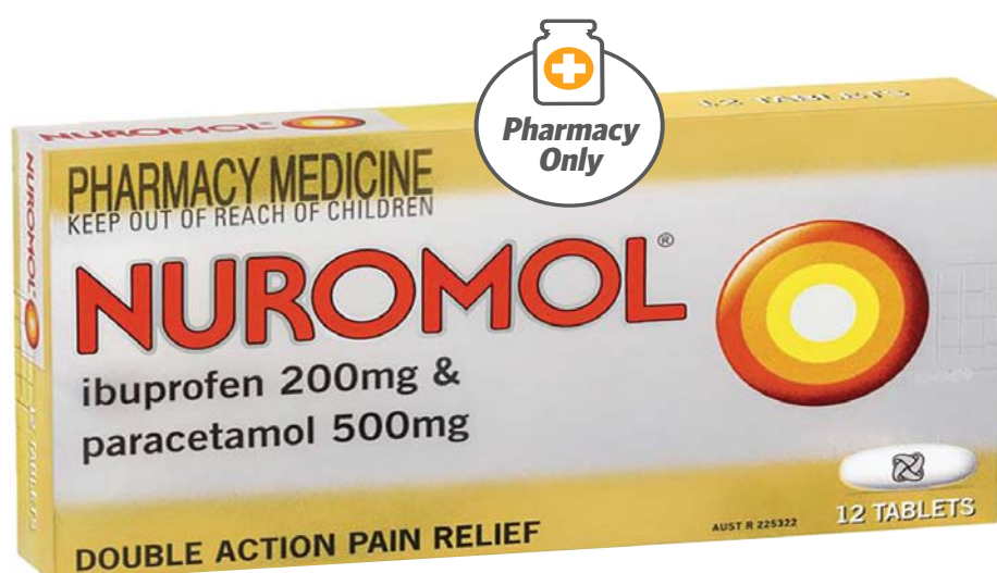
NUROMOL 12 Tablets*