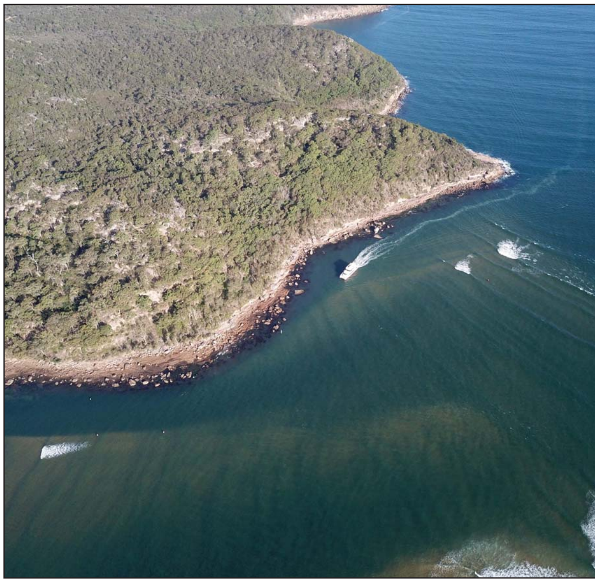
Recent drone photos show the extent of siltation of the channel