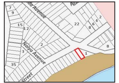
Item 259, Shop, 13 Bay Street, Patonga