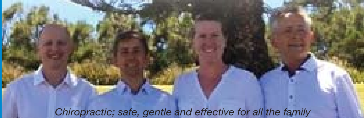
Chiropractic; safe, gentle and effective for all the family

As we say "adjust your spine, adjust your life..... and vis versa".