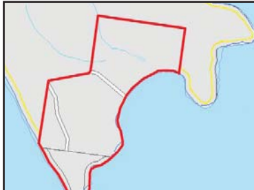
Item 261 Juno Point Military Site, Croppy Point, Patonga