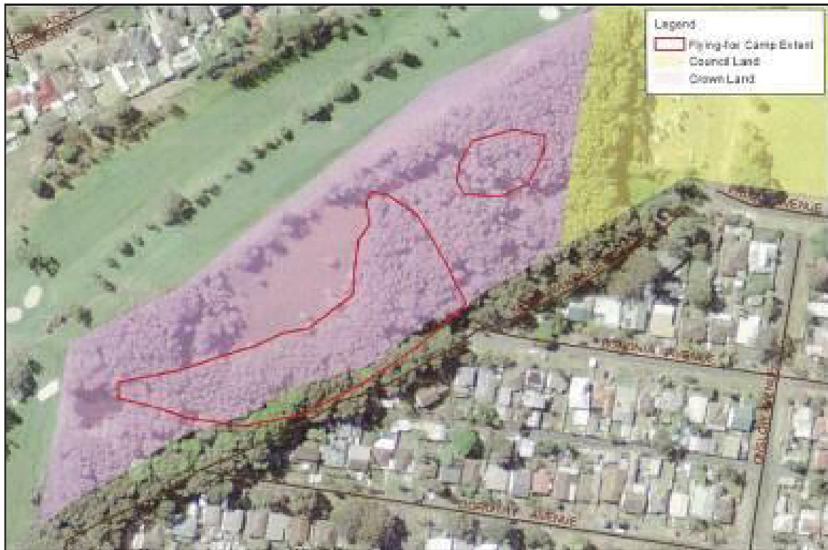
Land tenure of the Everglades flying fox camp

strategy is community education and engagement and the strategy details Council's proposed approach in this area.