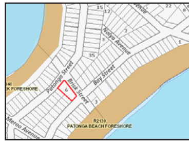
Item 257 Patonga Progress Hall, 6 Brisk Street, cnr Bay Street, Patonga