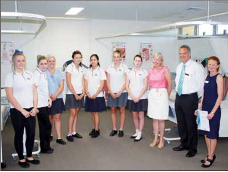
Graduates of the Health Services courses

Certificates have been awarded to 16 students at Brisbane Water Secondary School, the first graduates of the Health Services courses.