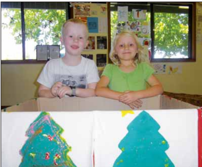
Students at Wallaby St Preschool