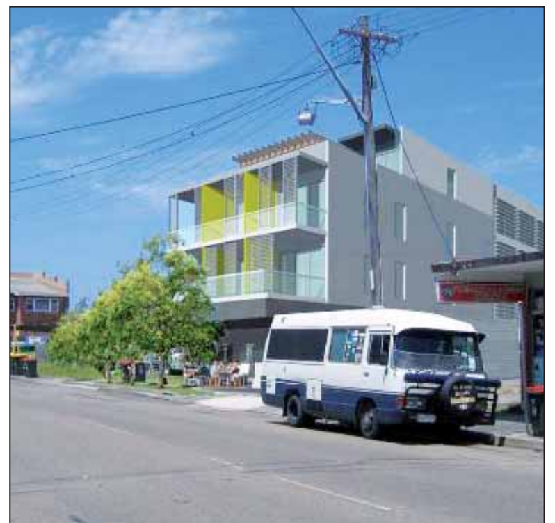
An artist's impression of the proposed boarding house

Media statement, 23 Nov 2011 Phil Moore, Gosford Council