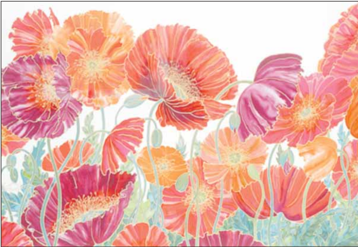
One of Ms Fletcher's works titled Hot Poppies