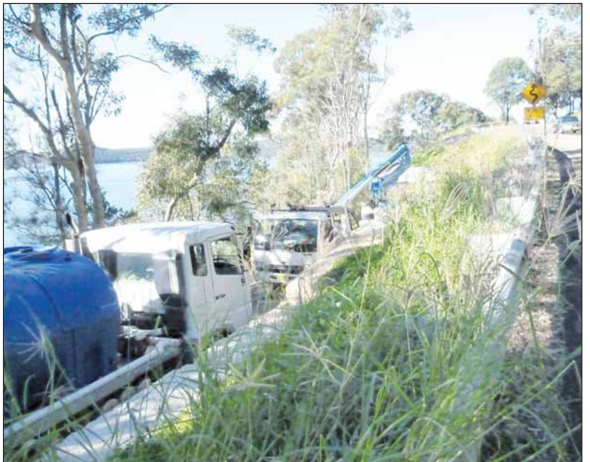
Rock bolting below heritage road

Media Release, 1 Jul 2011 Matt Pulford, Office of Deborah O'Neill MP