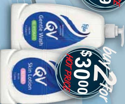
Ego QV 4L Range