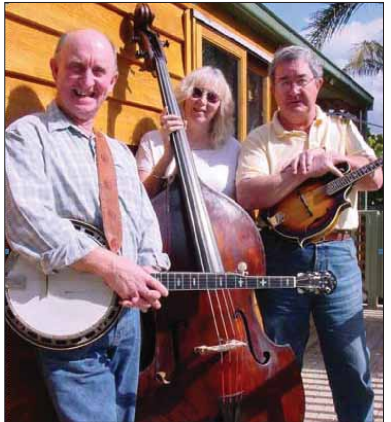
New York Public Library