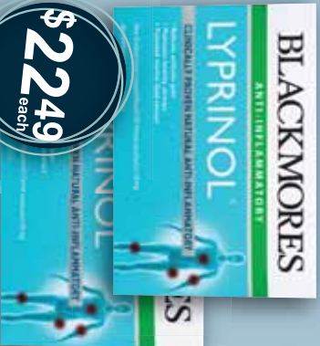
BM Lyprinol 50s*