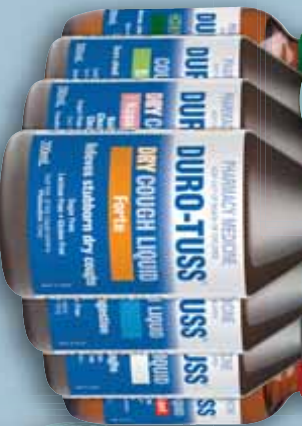
Duro-Tuss 200ml Range*