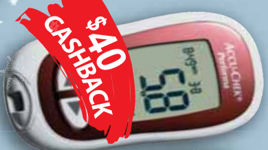
Accu-Check Performa & Performa Nano Blood Glucose Meter