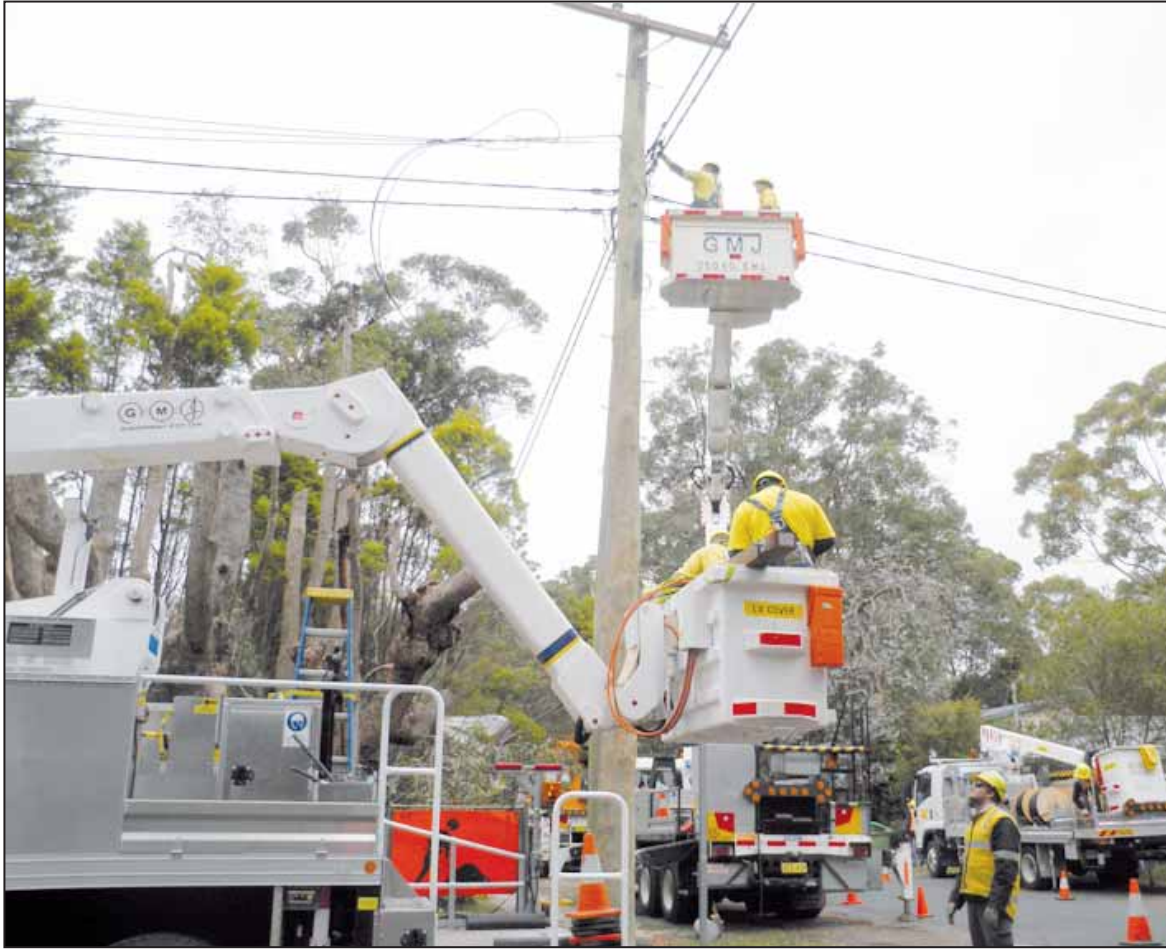
A transformer and pole changeover on Emerald Ave, Pearl Beach