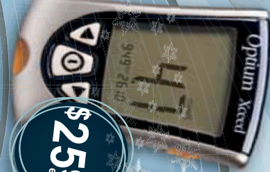
Abbott Optium Xceed & Freestyle Lite Blood Glucose Monitor