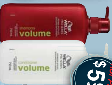
Wella Pro Series 750ml