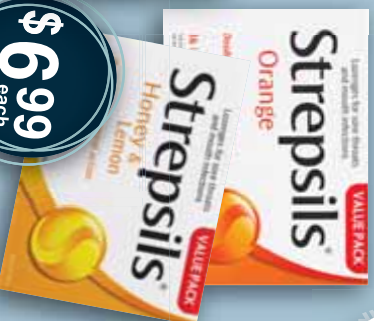
Strepsils Orange, Sore Throat Block Nose, & Honey and Lemon 3bs