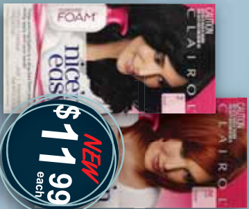
Clairro Nice N Easy Foam