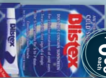
Blistex Cold Sore Cream 5g