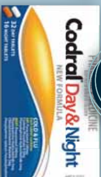
Codral Day & Night 48s*