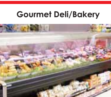
Gourmet Deli/Bakery Specialty Meals & Salads Prepared in Store