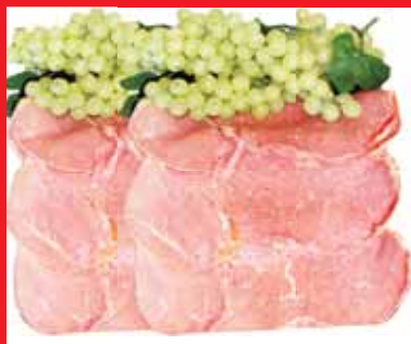
Freshly Sliced Silverside $9.99/kg