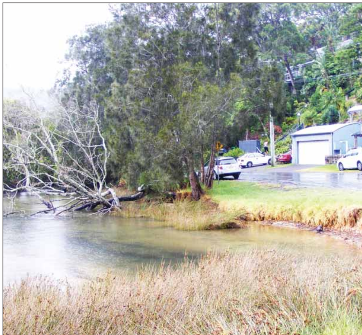
Contaminated water across from 36 Araluen Dr