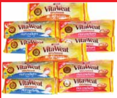
Vita-Weat Crackers 99c each