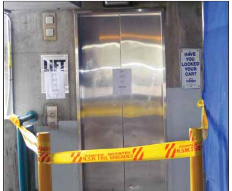
The damaged lift at Woy Woy commuter car park