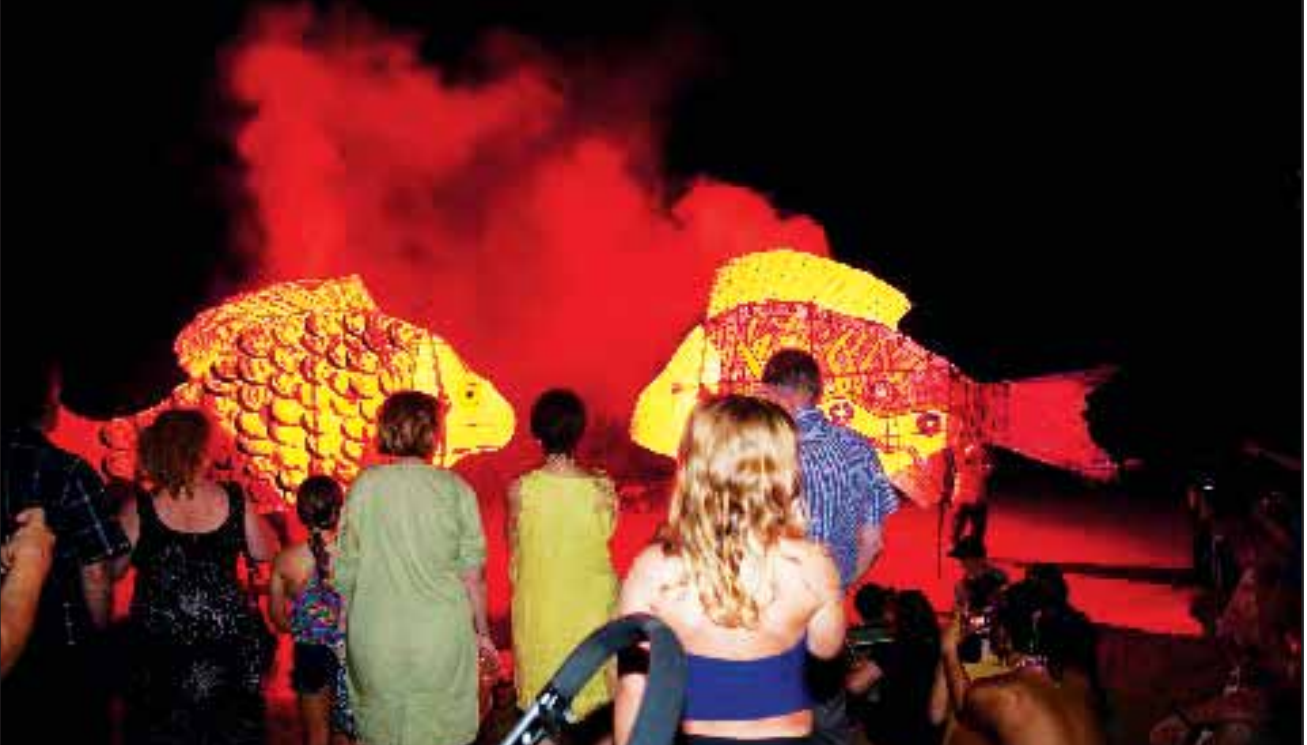
Australia Day celebrations at Woy Woy last year