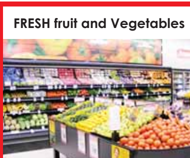
FRESH fruit and Vegetables Delivered 6 days a week