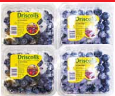
Blueberry Punnets $3.99 each