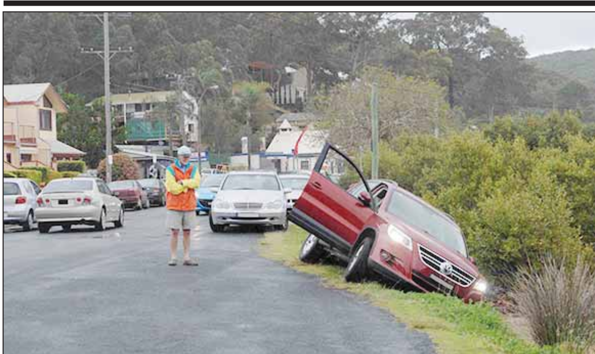
The car that almost overturned on Araluen Dr