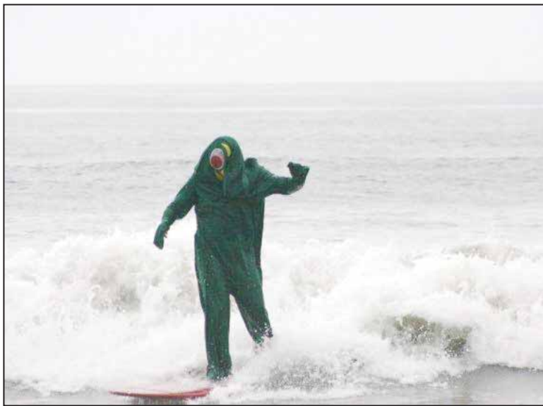
One of the costumes on the day