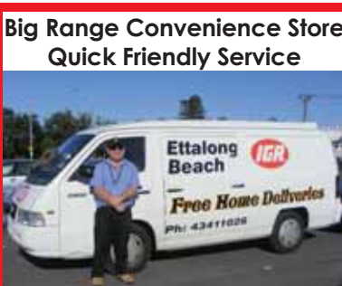
Big Range Convenience Store Quick Friendly Service Free home deliveries Refrigerated Vehicle