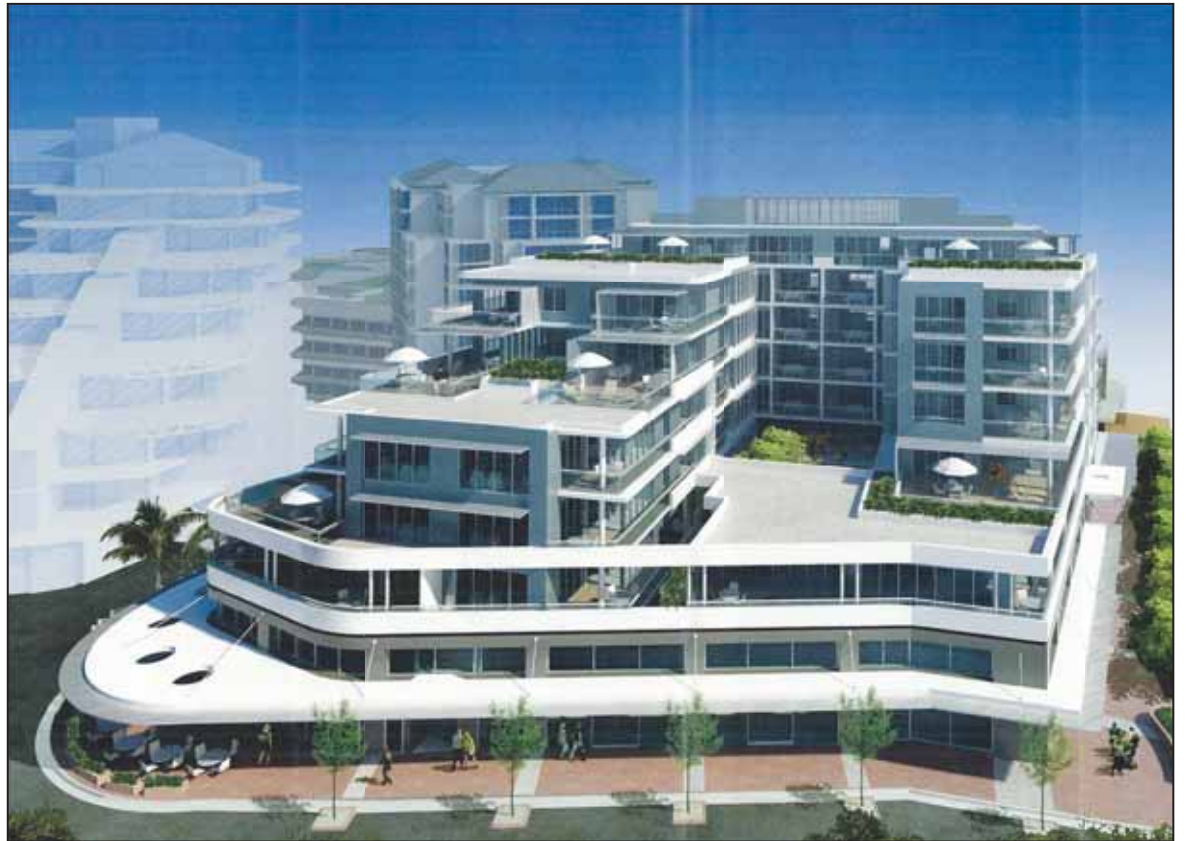
An artist's impression of the TESROL development at Ettalong