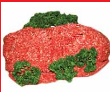
Premium Mince $8.99/kg