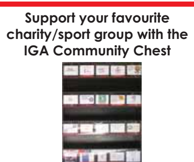
Support your favourite charity/sport group with the IGA Community Chest For every $20 Purchase 10c is Donated