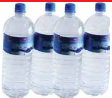
IGA Signature Spring Water 1.5L 89c each