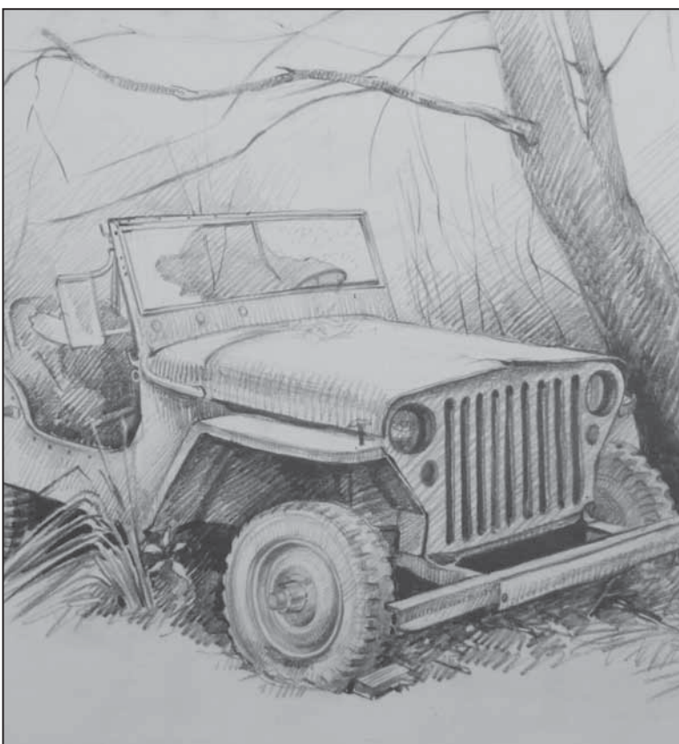
One of the drawings on display at the Patonga Bakehouse gallery