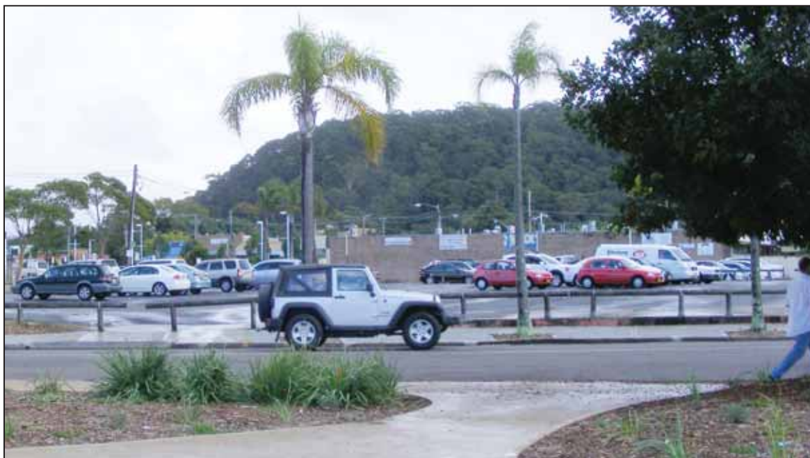
The TESROL development site at Ettalong