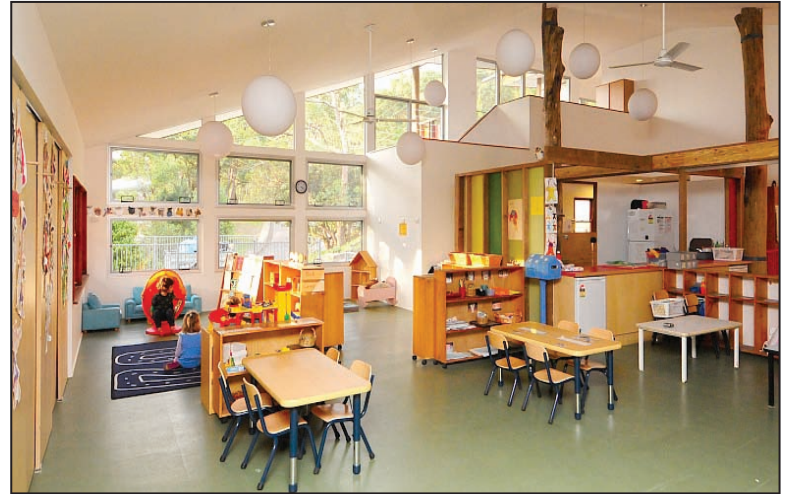
Inside the new Pretty Beach Community Preschool

Press release, 10 Sep 2010 Caroline Perryman, Pretty Beach Community Preschool