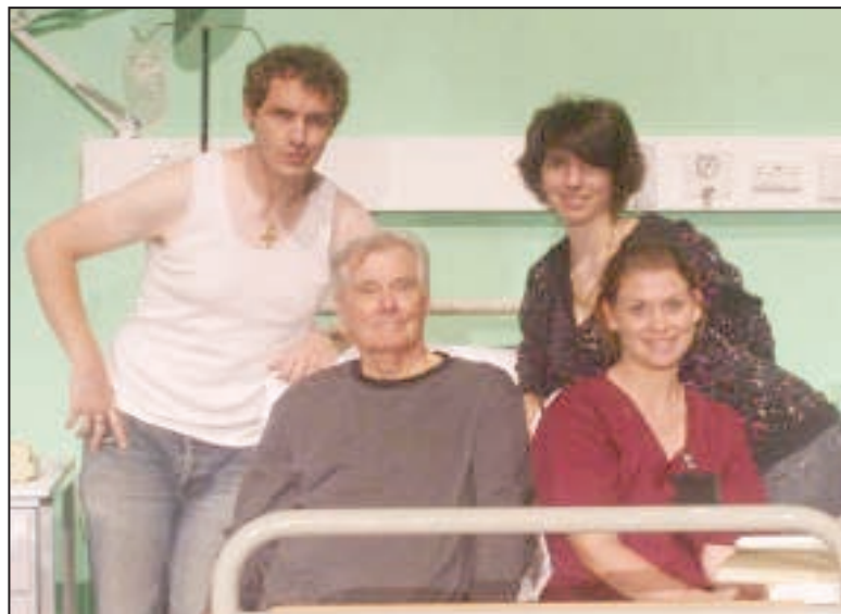
Cast members from Woy Woy Little Theatre's recent performance of Wrong Turn Lung Fish