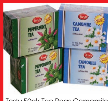
Tasty 50pk Tea Bags Camomile & Peppermint 89c each