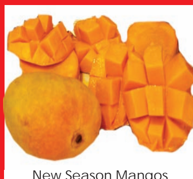
New Season Mangos $2.99each