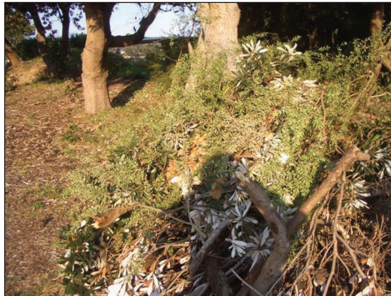
The Esplanade at Ettalong Beach where native vegetation has been chopped down