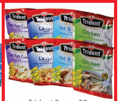
Trident Soups 50g 99c each

Specials available from Monday 13th September until Sunday 26th September