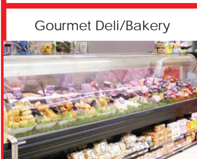
Specialty Meals & Salads Prepared in Store

Specials available from Monday 13th September until Sunday 26th September