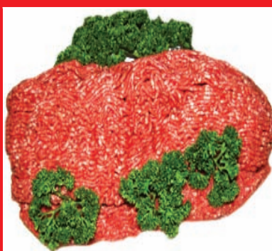
Gourmet Beef Mince $7.99kg