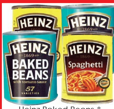
Heinz Baked Beans & Spaghetti 420g 79c each