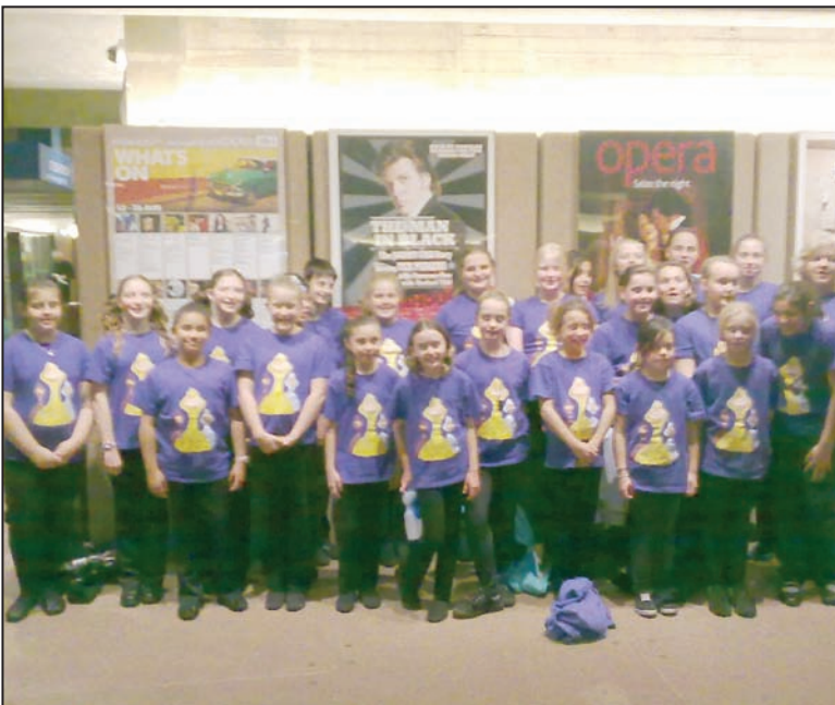
Students from Ettalong Public School backstage at the Sydney Opera House