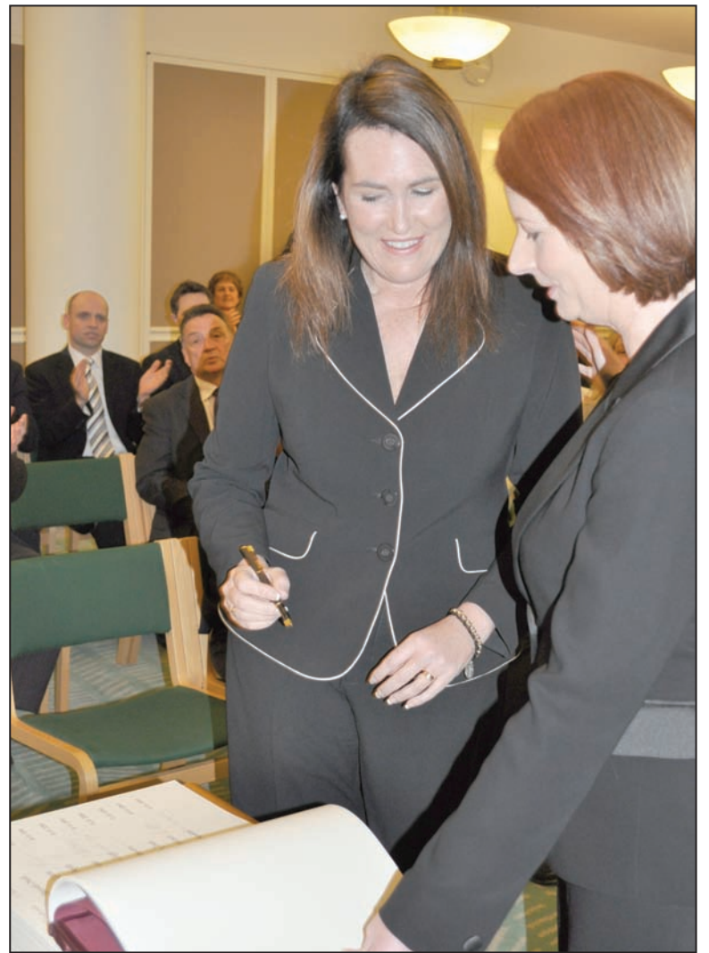
Newly appointed Member for Robertson with Prime Minister Julia Gillard at the signing of the Caucus Book at Parliament House in Canberra on September 9