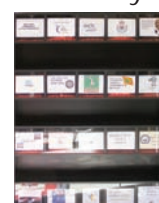
For every $20 Purchase 10c is Donated

Support your favourite charity/sport group with the IGA Community Chest