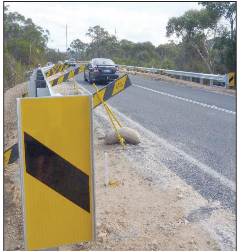
Road works being carried out by Gosford Council along Woy Woy Rd