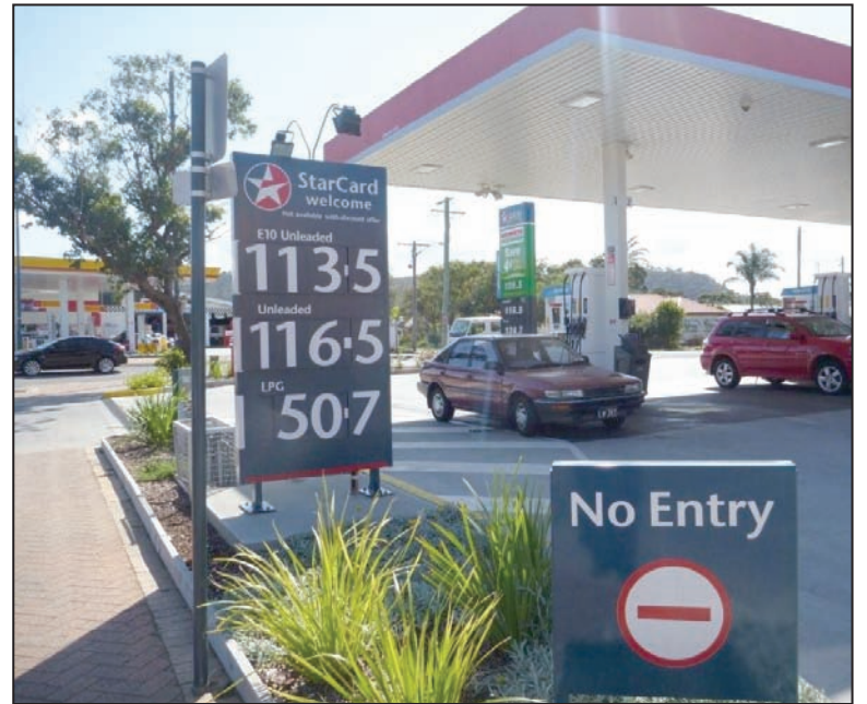
The new Woolworths Caltex petrol station in Umina opposite the Shell Coles Express petrol station