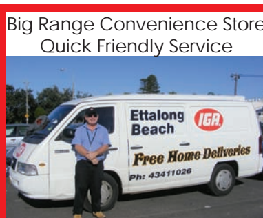
Free home deliveries Refrigerated Vehicle