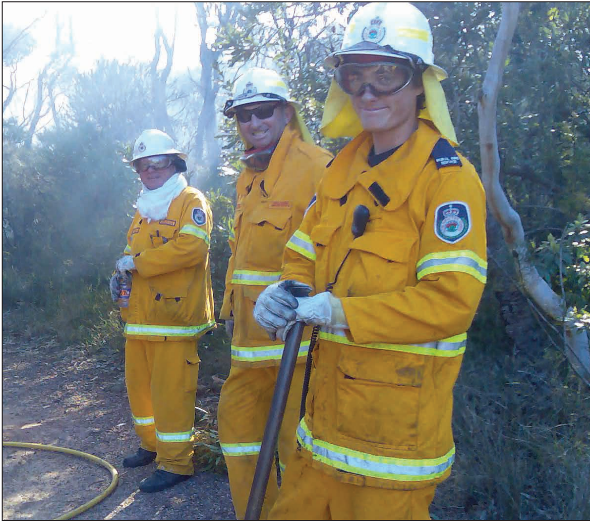
Members of the Killcare Wagstaffe Rural Fire Brigade perform hazard reduction burns around Bouddi National Park recently