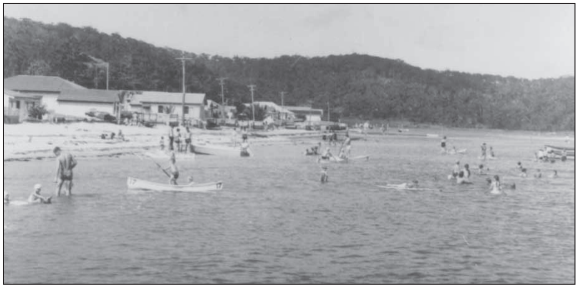
Swimmers enjoy Ettalong Beach in the 1950s where Learn To Swim classes took place