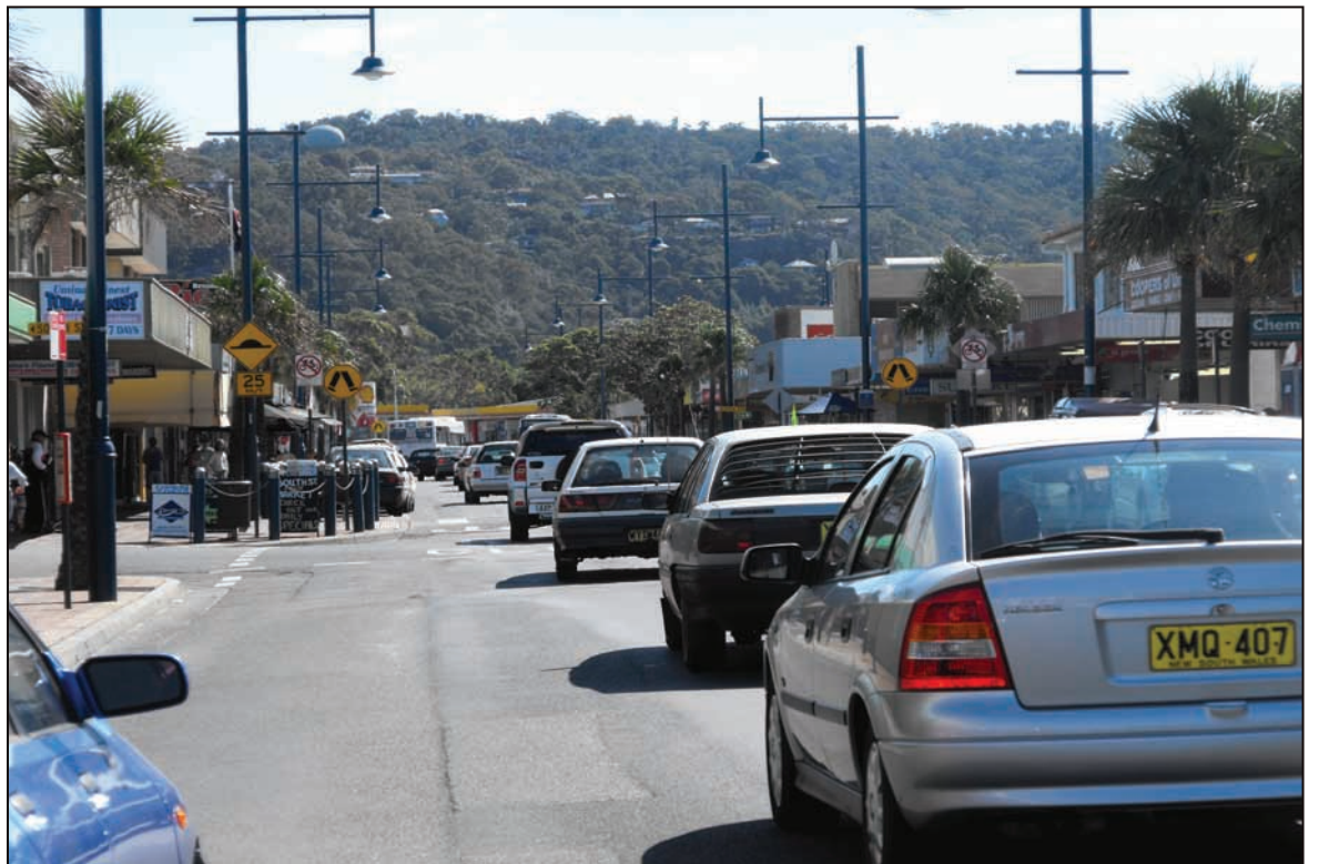
West St, Umina, will be transformed when the first annual Umina Beach Festival is held on December 12.