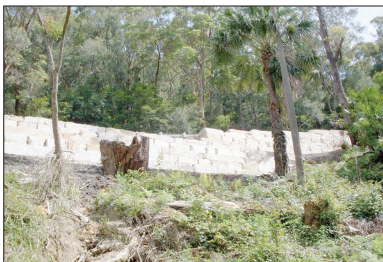
Slip repair work carried out by Gosford Council following the partial road collapse on Woy Woy Rd in April this year