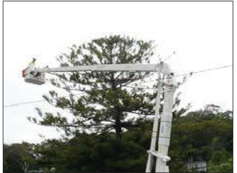
Gosford Council workers install Christmas lights in Wagstaffe