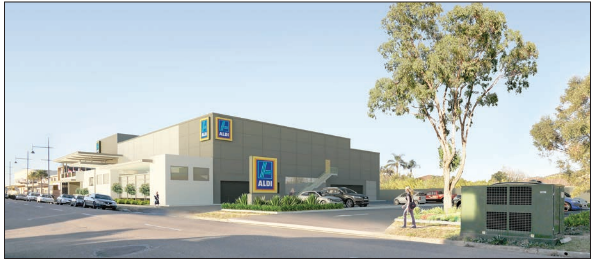
An artist's impression of the new Aldi site in Trafalgar Ave, Umina Beach

Press release, 16 Dec 2008-12-18 Carolyn Carter, Peninsula Community Drug Action Team