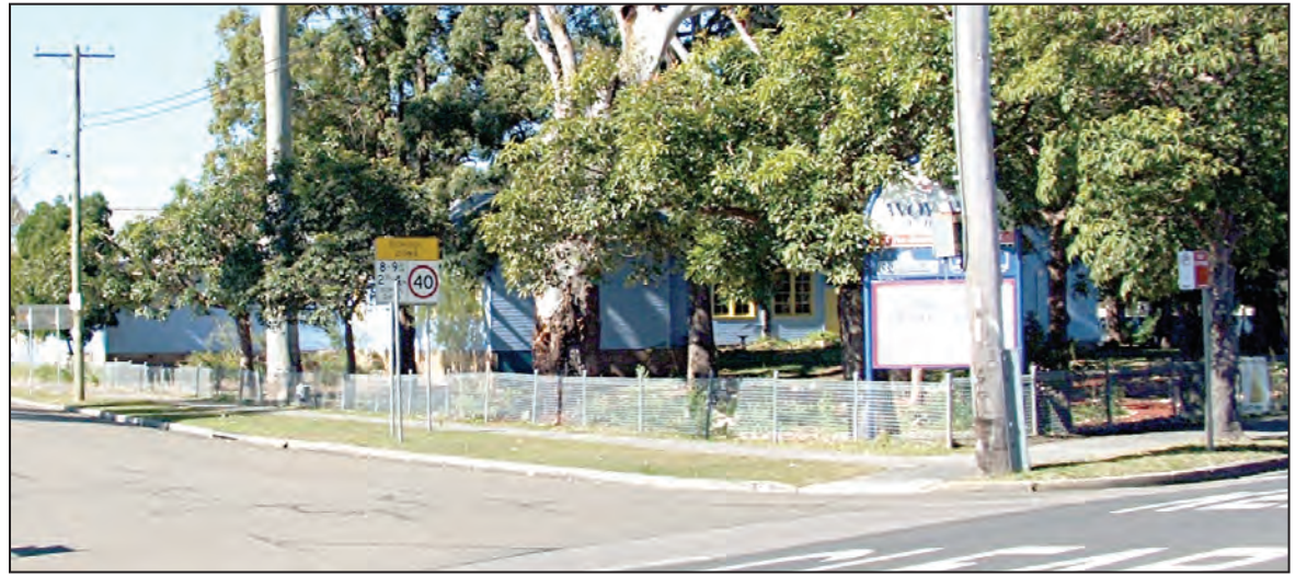
Woy Woy Public School will receive new toilet facilities as part of a Government Program.