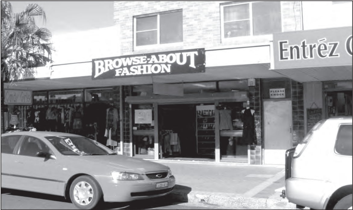
The Browseabout fashion store at West St, Umina