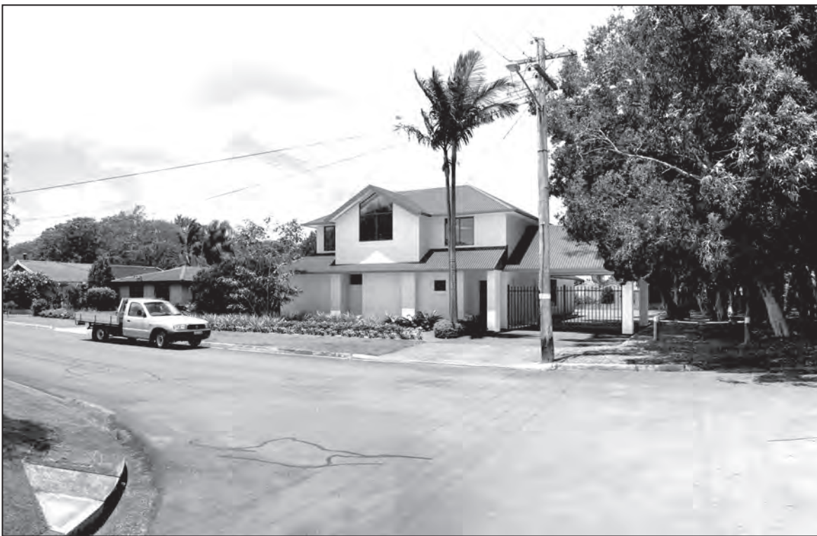
A computer-generated image of the proposed second storey addition for the Jehovah's Witness Kingdom Hall, Woy Woy.

Press release, 7 Jul 2008 Lisa-Maree Schell, Gosford Council