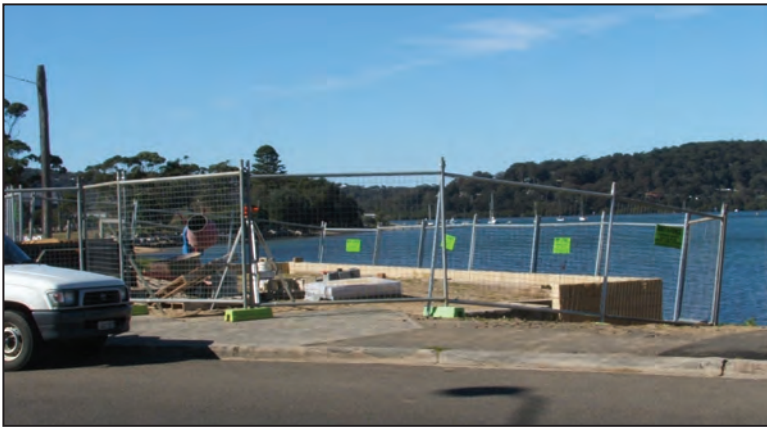
Construction of the first viewing platform begins at Ettalong Beach foreshore