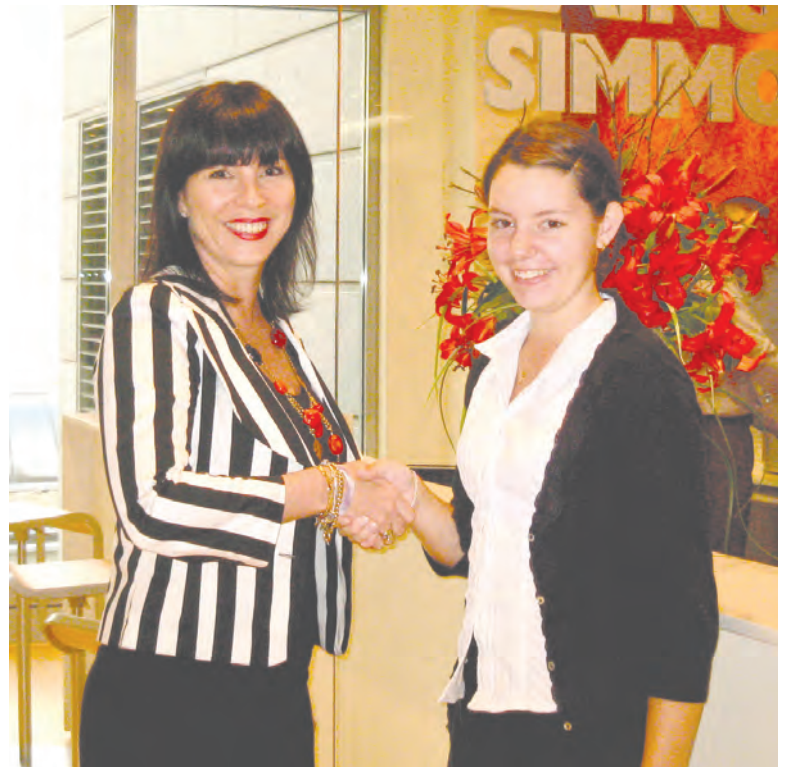
School Leavers can take up a real estate career at Laing and Simmons