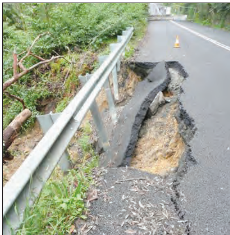
The collapsed section of Woy Woy Rd before barriers and a metal chain-link fence were placed along the road and around the damaged section of road

"A number of council and State Government officials together with