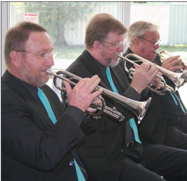
Brisbane Water Brass cornet players