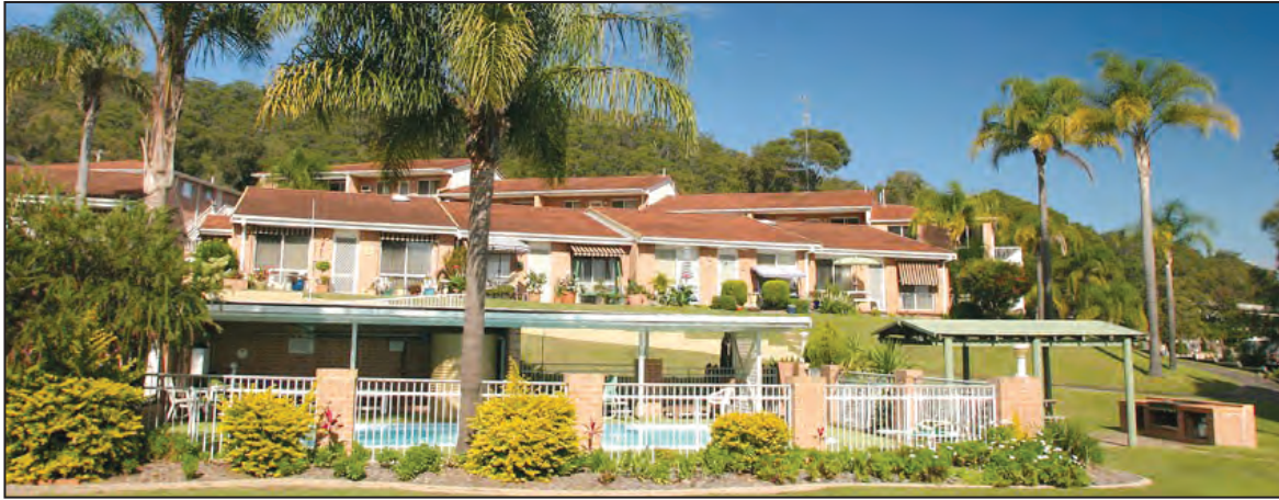
The Cove at Daleys Point