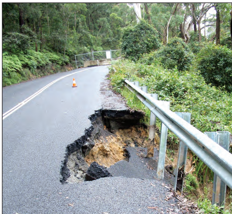
The collapsed section of road on Woy Woy Rd at Bulls Hill Woy Woy.