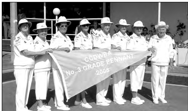
Ettalong's Grade 3 winners