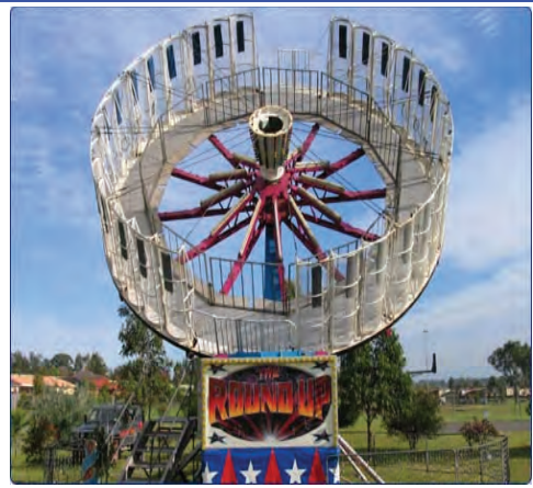
On the Dodgem cars, Giant slide, Jumping castle and the Roundup.

*$20.00 Presale before the 18/05/08 or $25.00 On the day