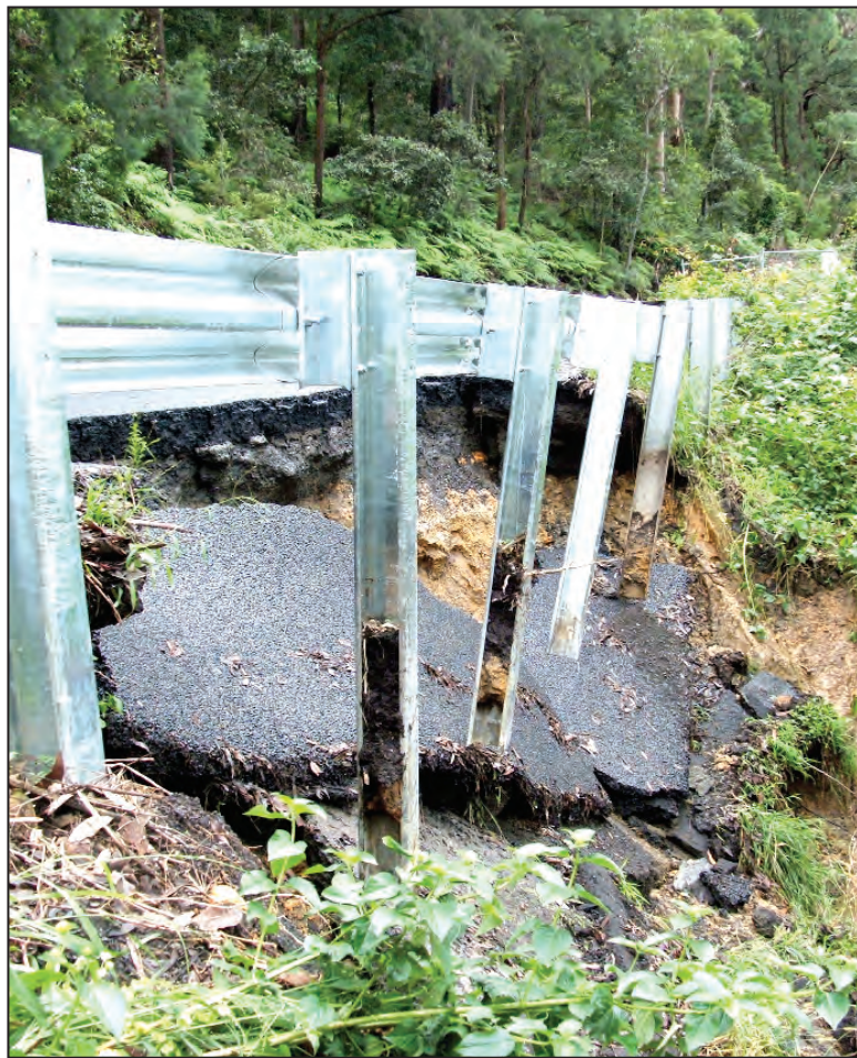
Part of the guard rail along Woy Woy Rd is suspended above the collapsed section of road