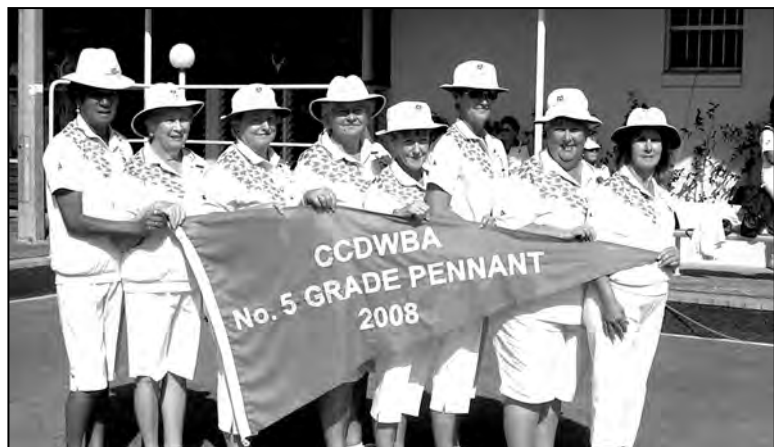
Umina's Grade 5 winners

Press release, 13 April 2008 Craig Coulton, Ocean Beach Malibu Club