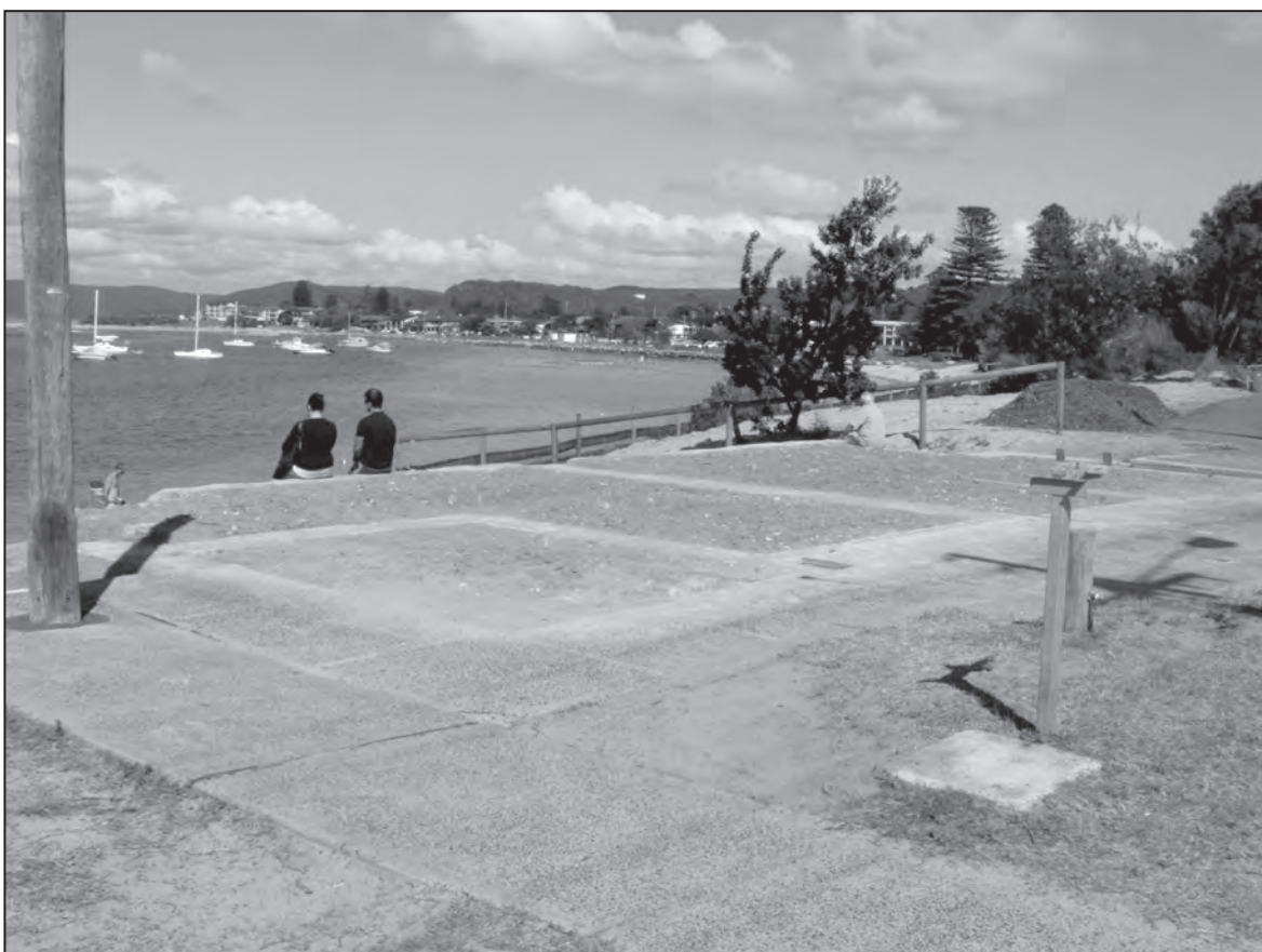
The demolished toilet block with the removed vegetation in the background