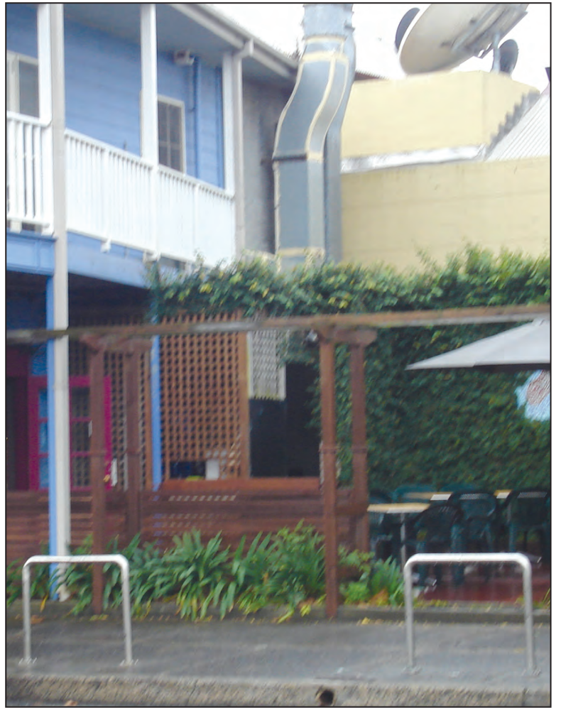
The two new bike racks outside the Gnostic Cafe

Sponsored by Peninsula News Community Access