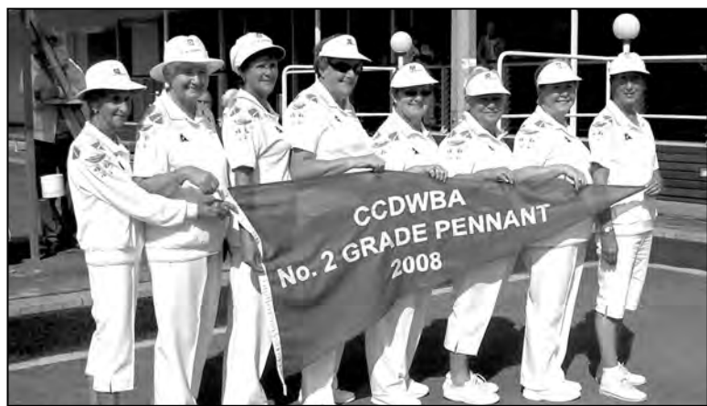
Ettalong's Grade 2 winners

Three Peninsula women's bowls teams received first place in the finals play-off series at Umina Beach Bowling Club from April 14 to 16.