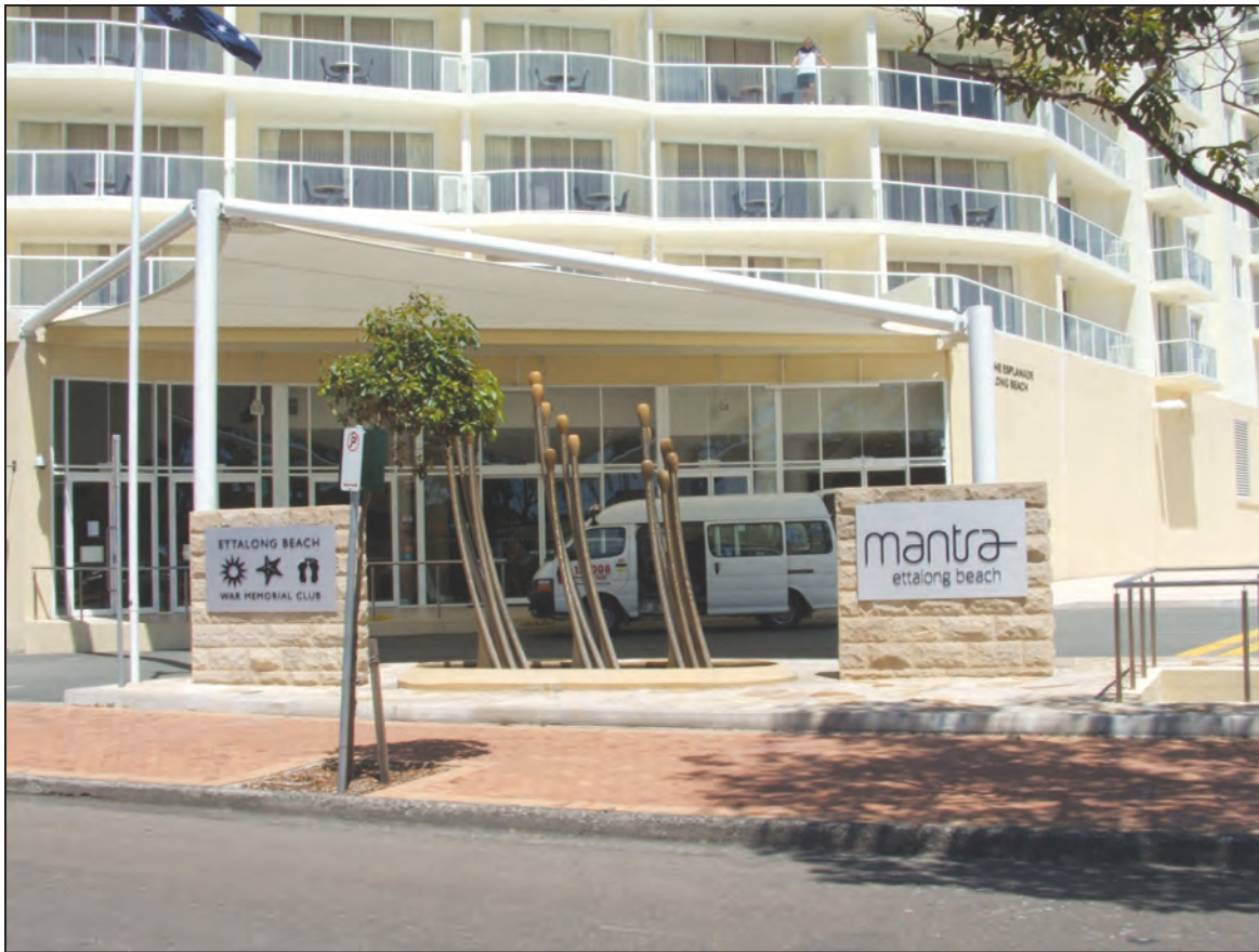
The Ettalong Beach War Memorial Club and the Mantra Resort