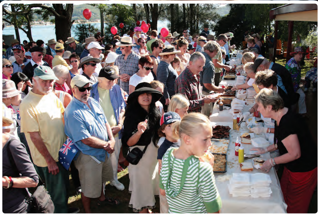
Crowd at Wagstaffe