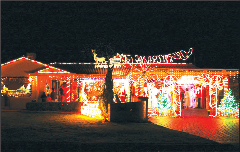
3 Salacia Ave, St Huberts Island