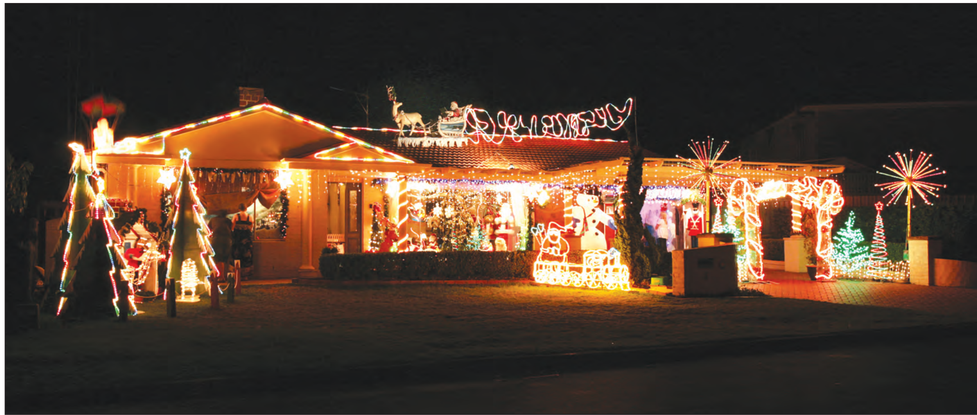
Christmas lights at 3 Salacia Ave St Huberts - - See more page 17

THIS ISSUE contains 53 articles. Read more at www.PeninsulaNews.asn.au