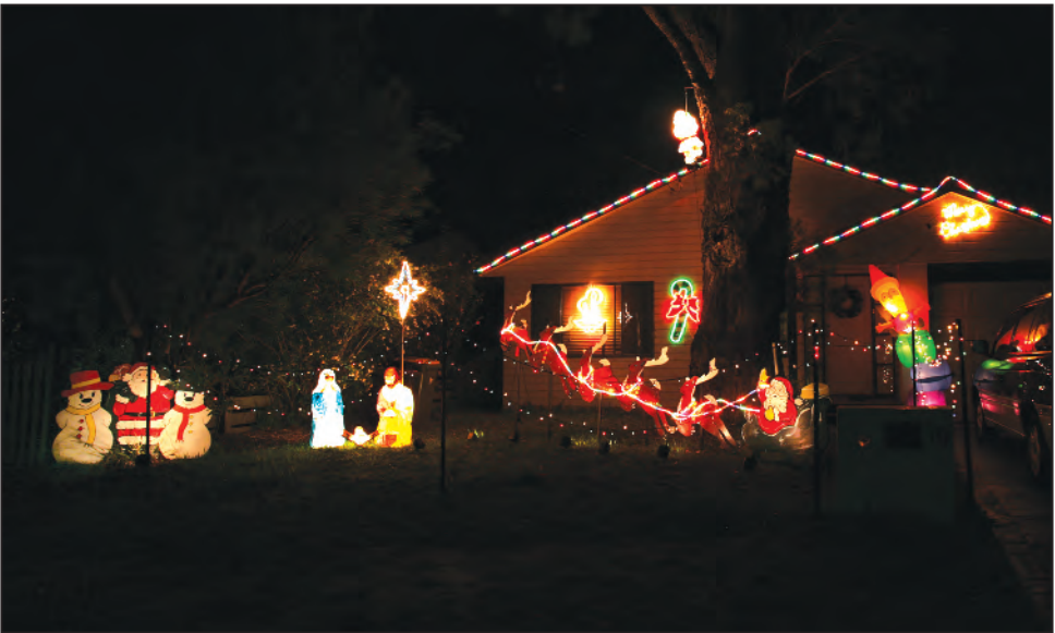
19 Veron Rd, Umina Beach