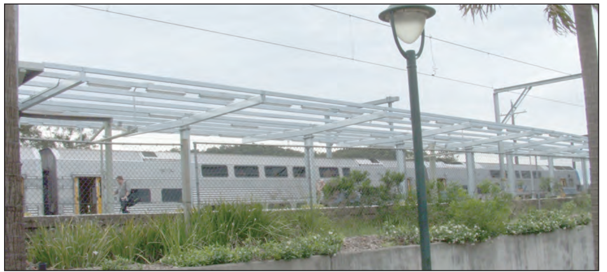
The new station canopy at Woy Woy station

Press release, 17 Dec 2007 Community Environment Network