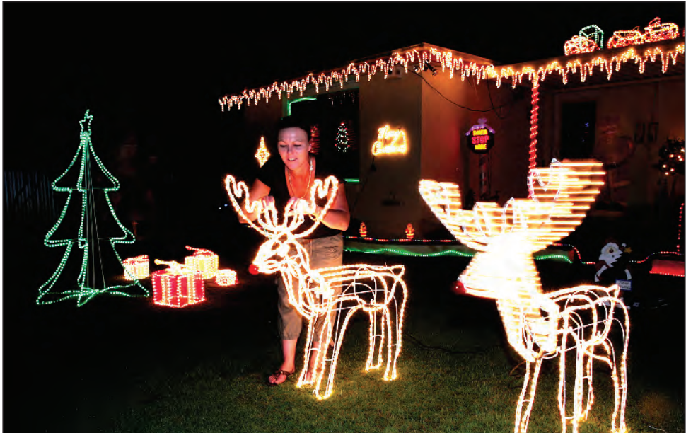
4 Carpenter, St Umina Beach - Janene York