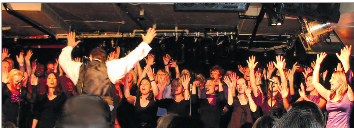
Jonah and the Wailers