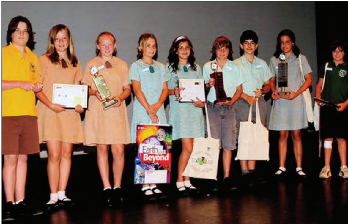
Pretty Beach Public School received recognition for its 'Cool It' campaign.