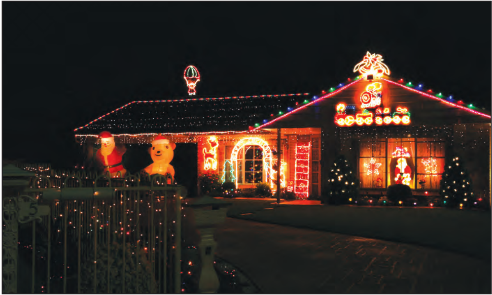
4 Macquarie Pl, Heritage Estate