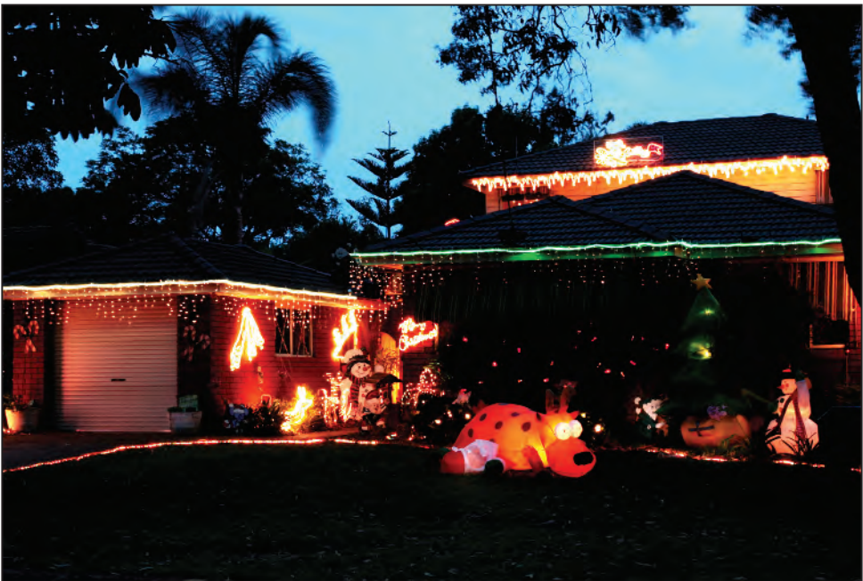
34 Carpenter St, Umina Beach