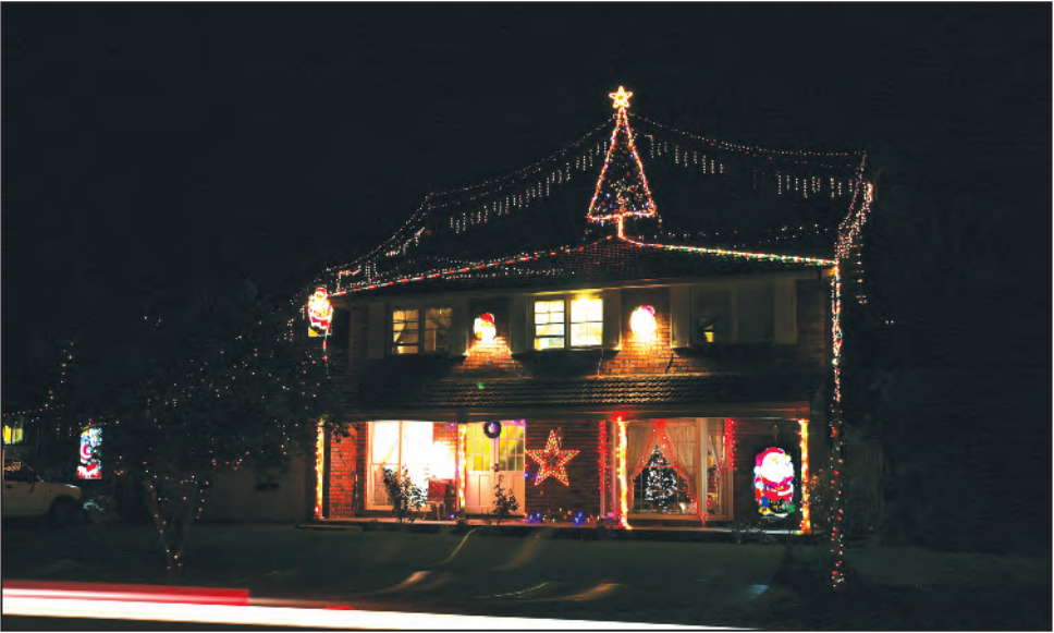
4 Jimba Cl, Woy Woy