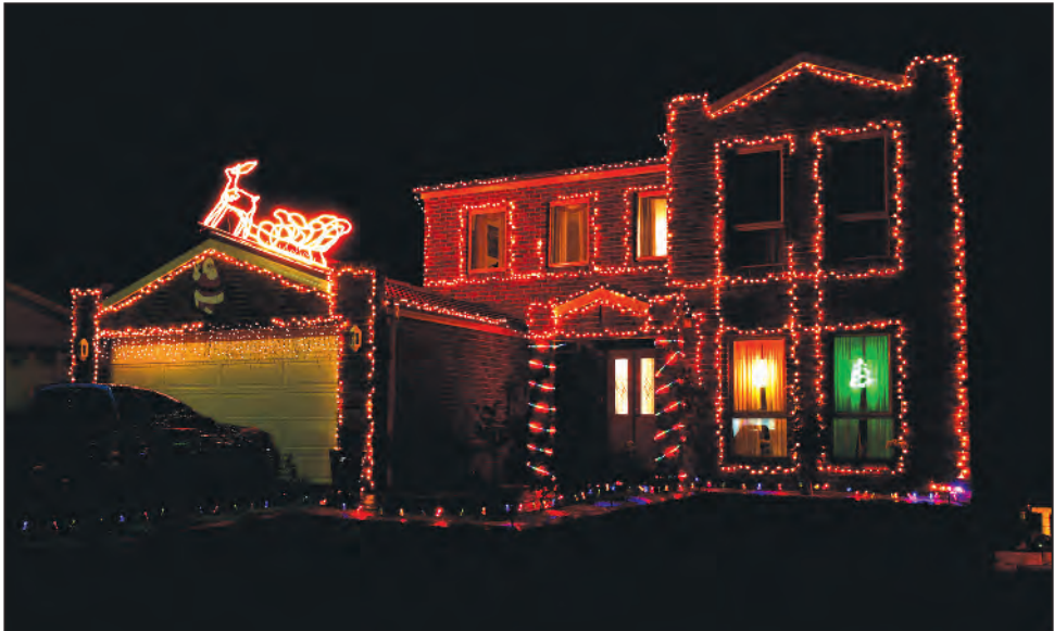
26 Burdett Pl, North Pearl