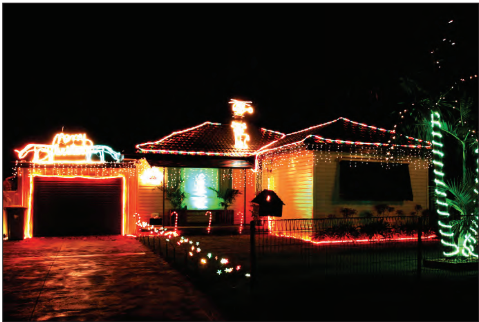
67 Dunbar Rd, Woy Woy