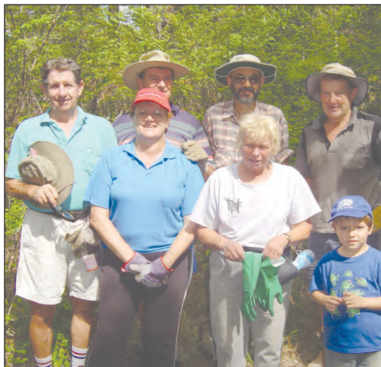
Volunteers (at Burrawong Reserve clean-up)