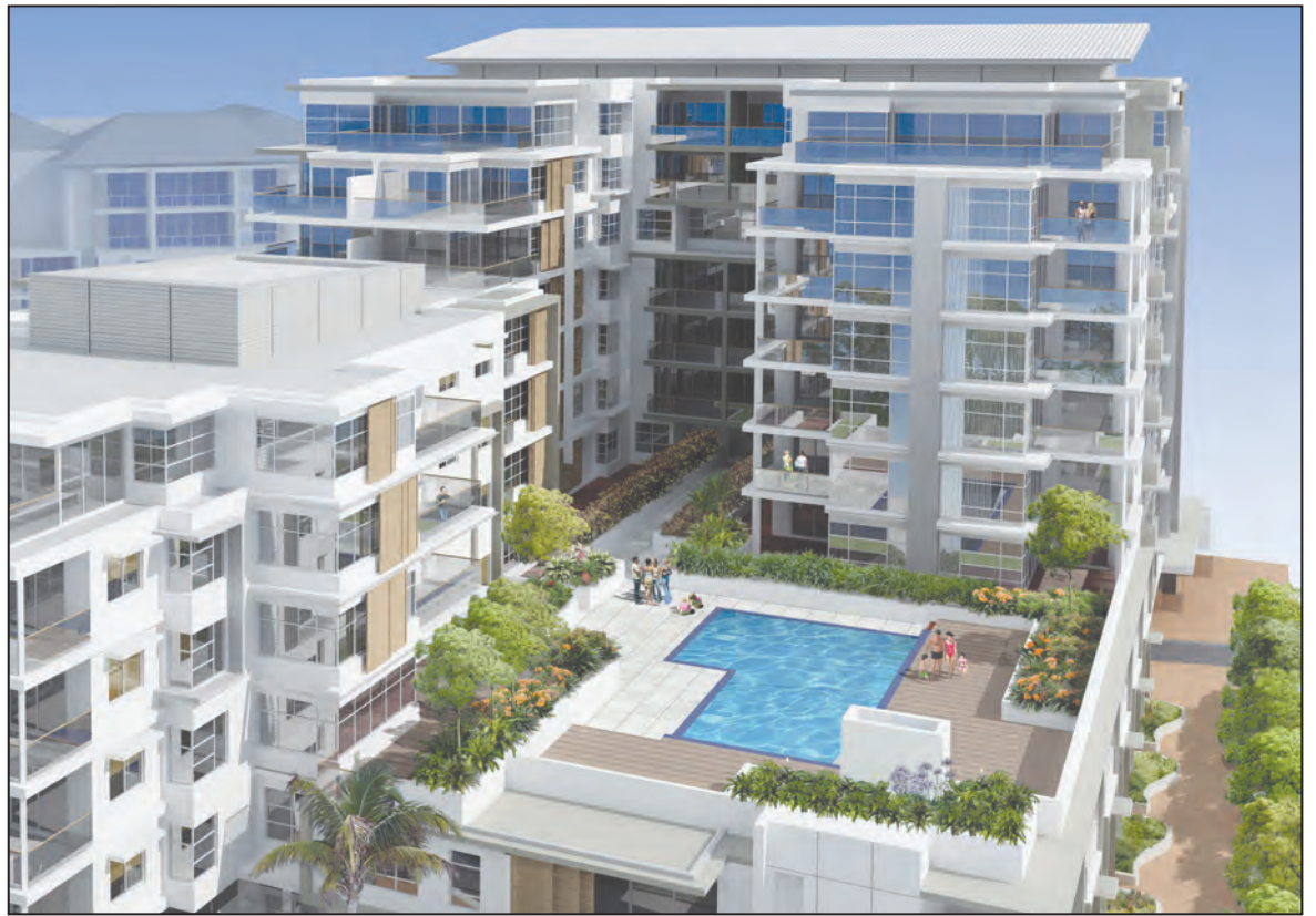
An artist's impression of the original proposed development