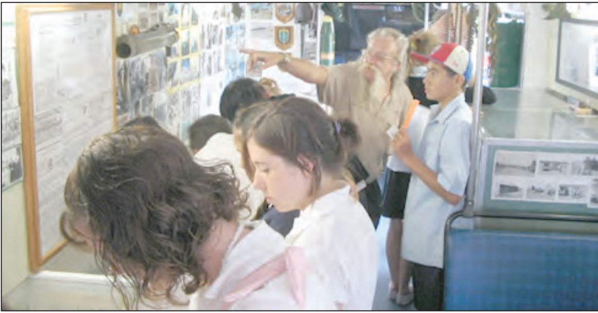
Students of Brisbane Water Secondary College view the exhibits in the Nambus