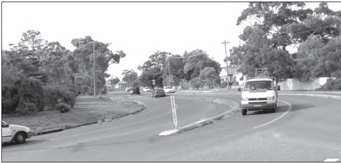
Sydney Avenue between Hobart Ave and Brisbane Ave