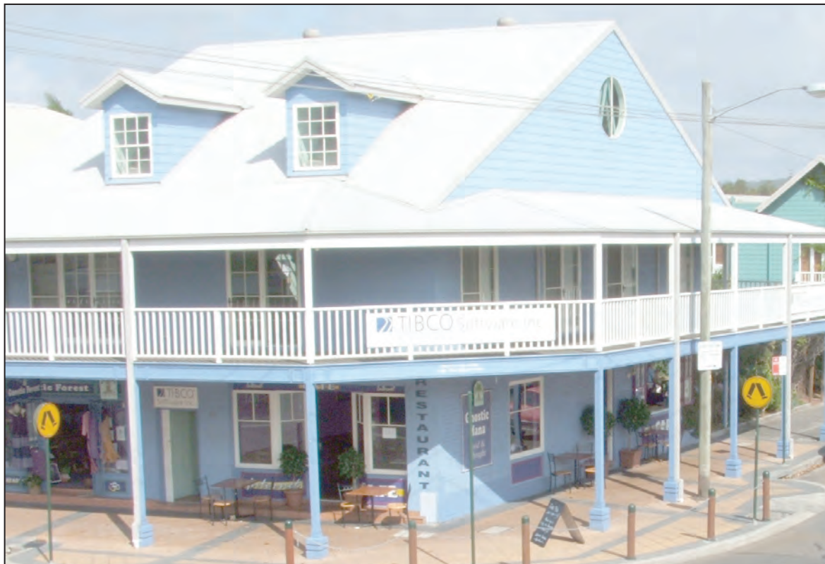
Gnostic Corner businesses are celebrating their growth over 8 years.