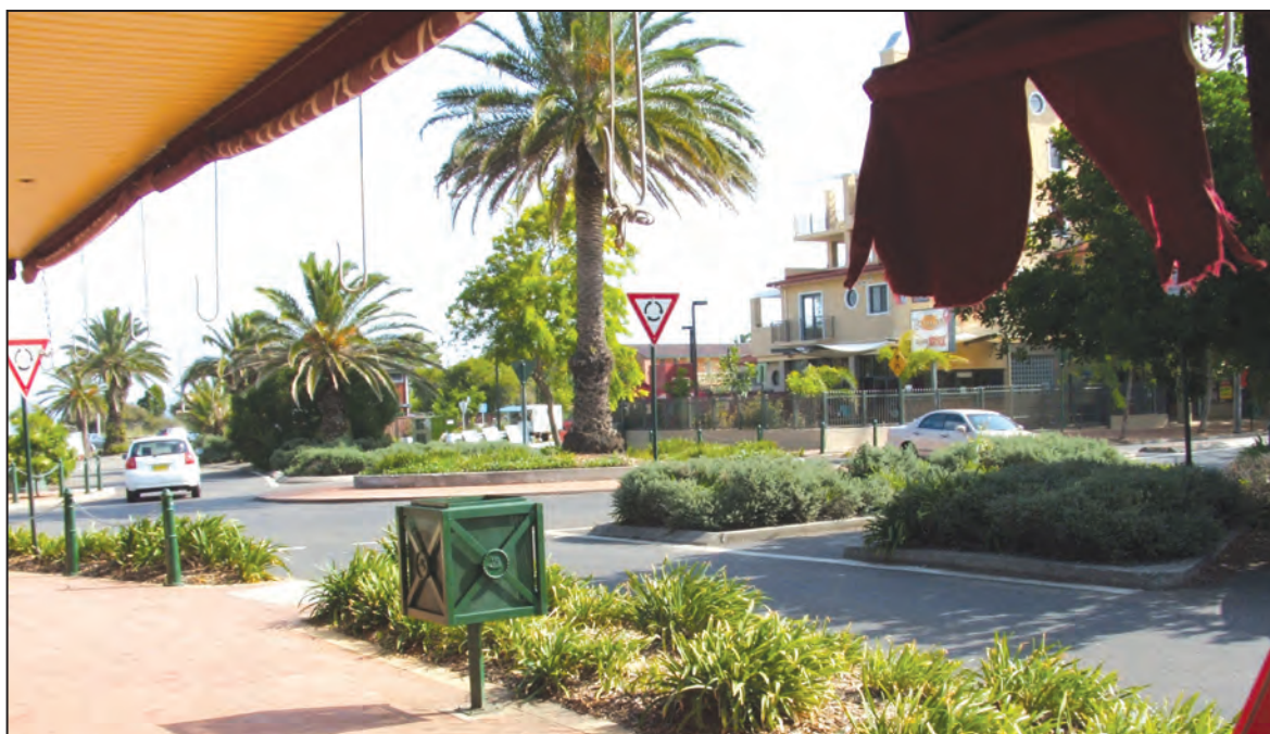
The intersection of Ocean View Rd and Picnic Pde at Ettalong