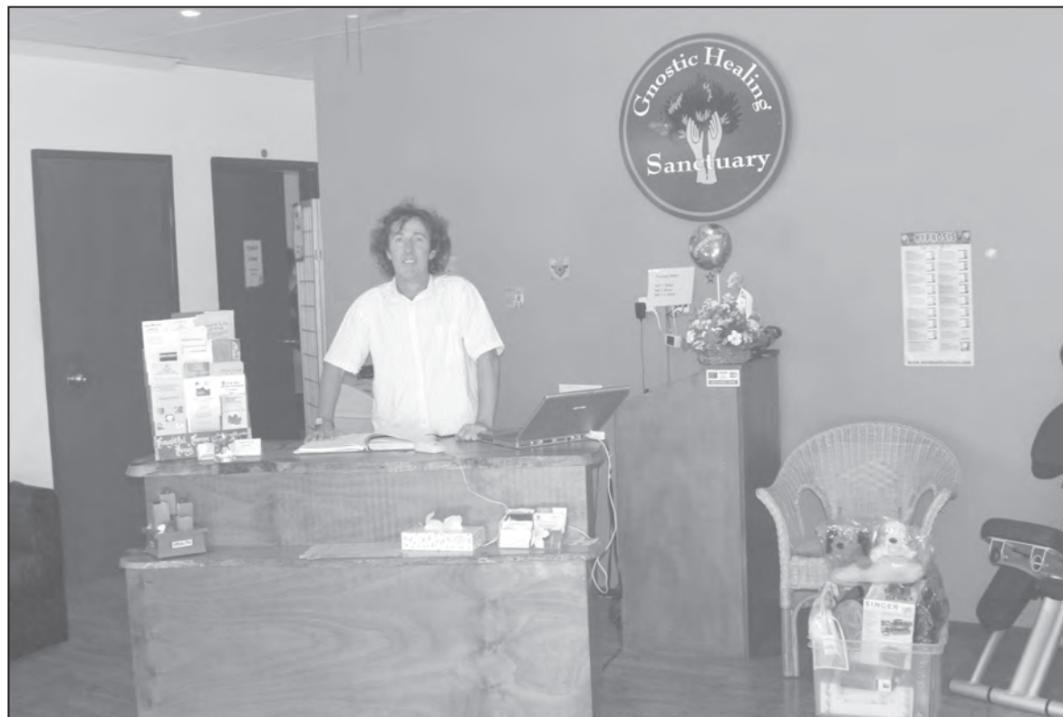
The Gnostic Healing Sanctuary has expanded its premises