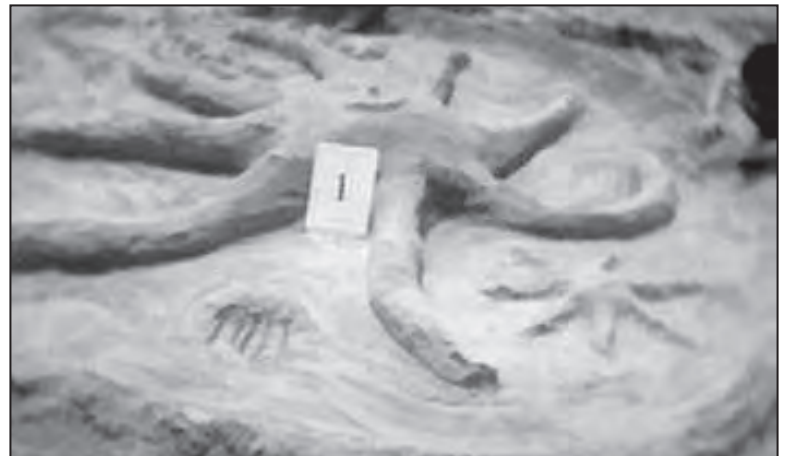
The winning sculpture in the children's category