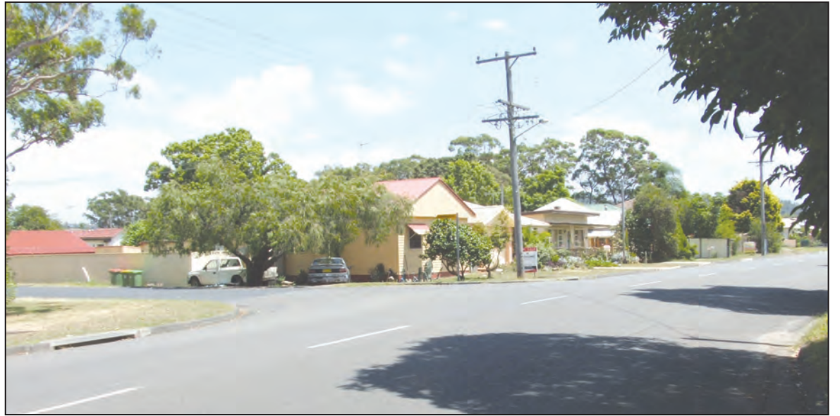
The northern end of Commonwealth Ave, Blackwall