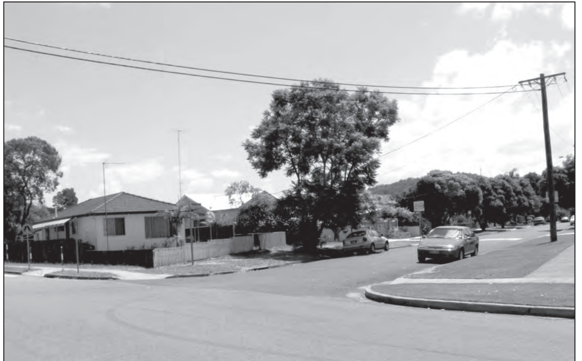
The intersection of Victoria Rd and Park Rd, Woy Woy