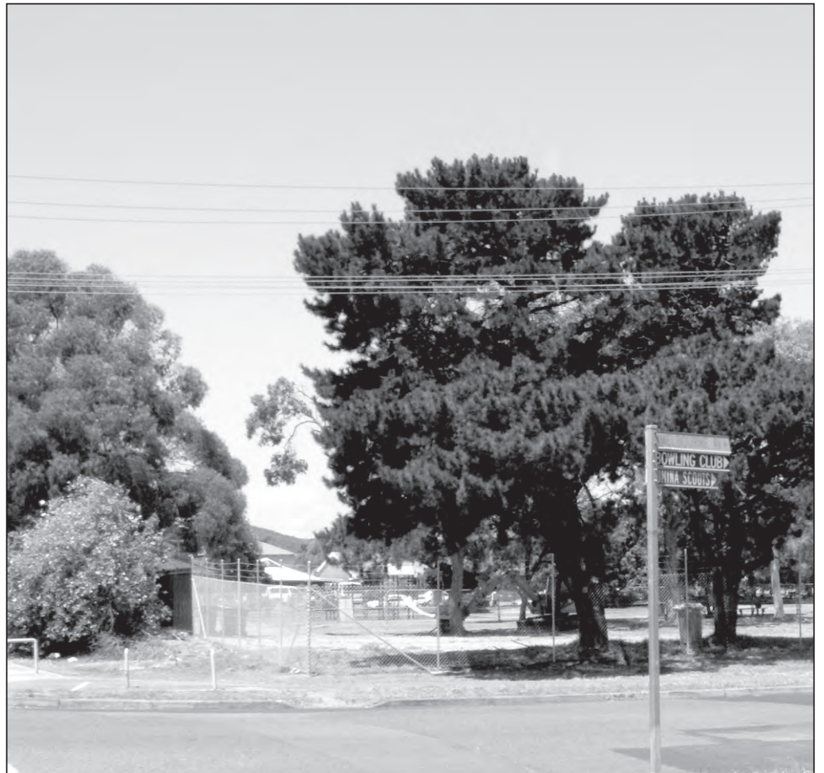
The site for a new two storey classroom block at Umina Public School