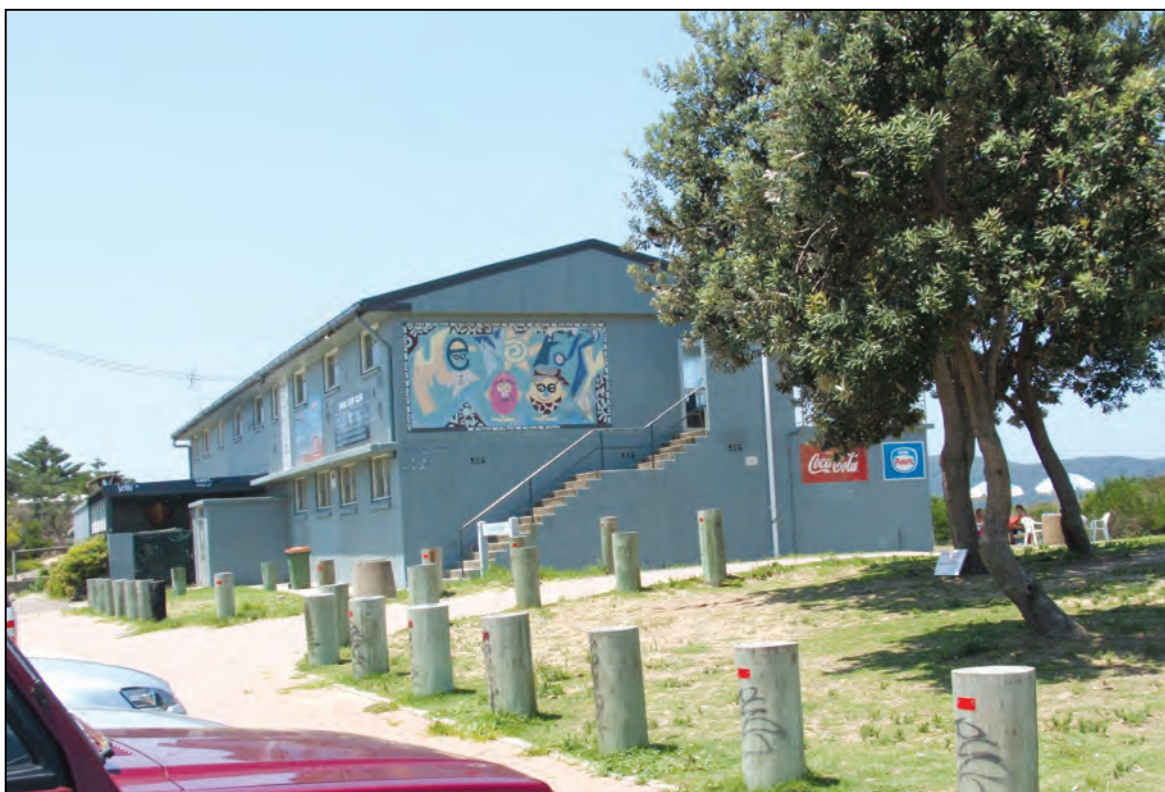
The Umina Beach Surf Club

Press release, February 8 Laura Clyne, Gosford Council