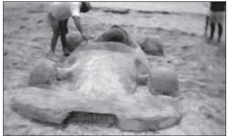
The winning sculpture in the adult's category