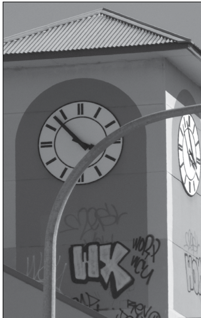
Graffiti appeared on the clock tower at Woy Woy recently