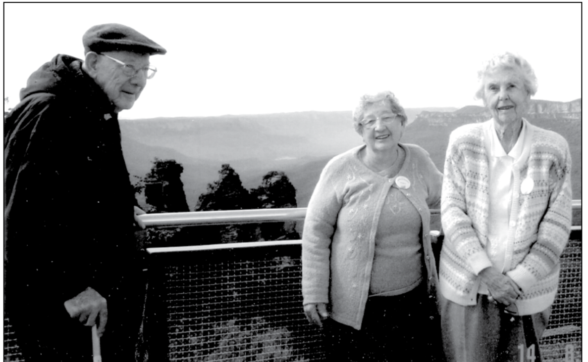
Woy Woy Aged Care Hostel residents visited the Blue Mountains

Peninsula residents have been asked to show their support by giving blood at Woy Woy Donor Centre, Woy Woy Hospital, Ocean