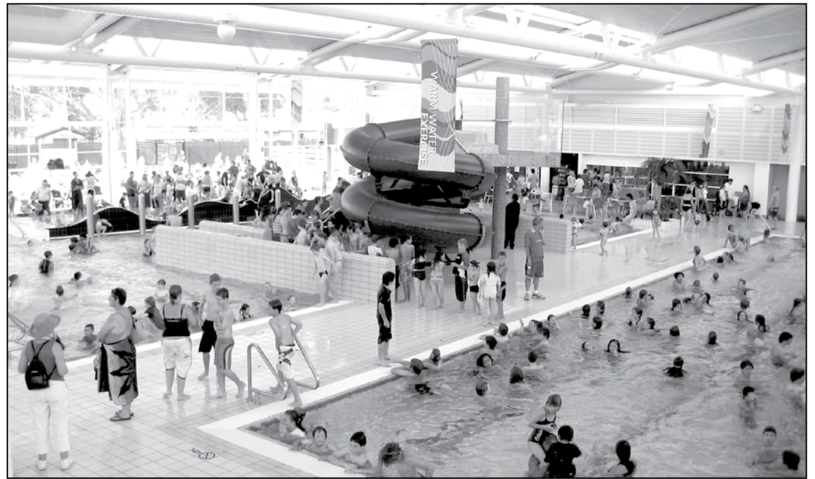
More than 8000 people celebrated the opening of the Peninsula Leisure Centre

Press release, November 9 Pat Lewis, Brisbane Water Secondary College