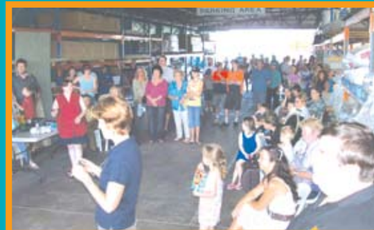
Part of the crowd eagerly awaiting the draw