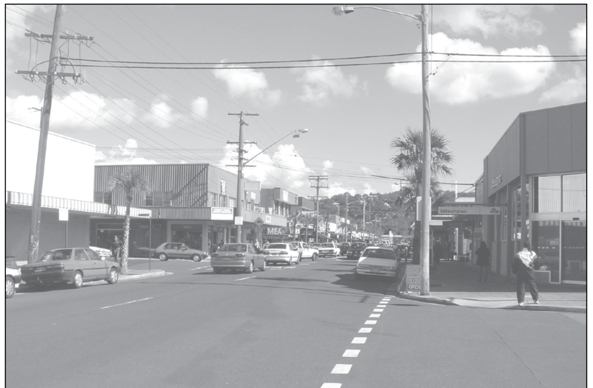
West St Umina