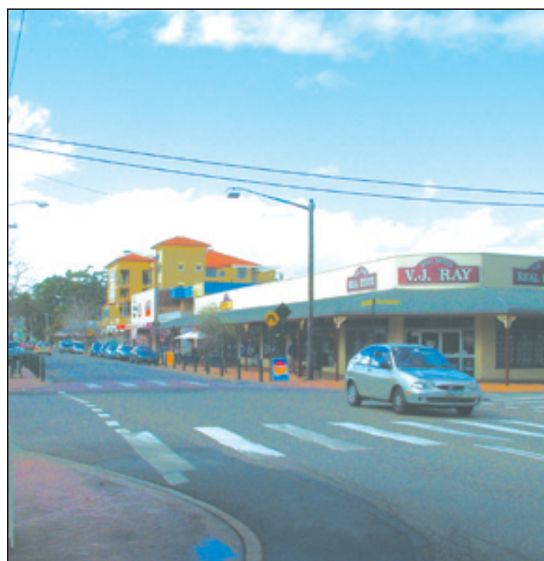
The main street of Ettalong recently suffered a spate of vandalism