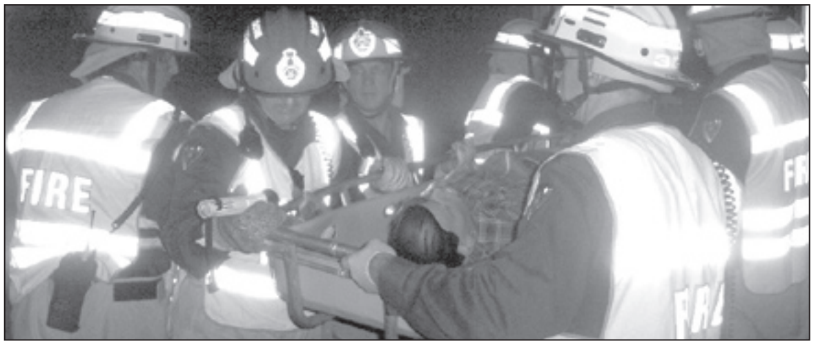
Fire brigade members carry a casualty to safety