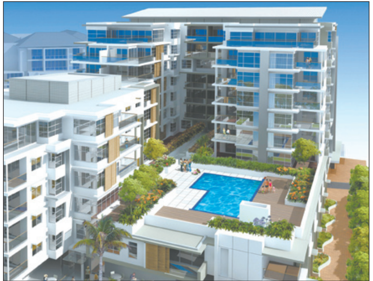
Tesrol's model of the new Ettalong proposed development

Peninsula Urban Directions Strategy, April 15