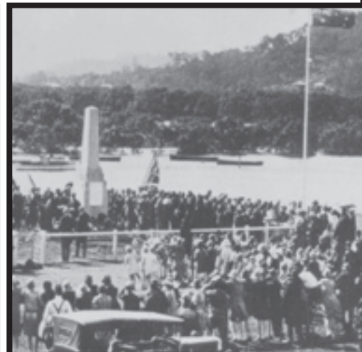
ANZAC Day service Memorial Park, Woy Woy 1930s

Those desiring to participate in the wreath laying ceremony, or who require further information, should contact the Sub Branch on 4341 2594. In the event of heavy rain, the main service will be held in the Senior Citizens Centre, Ettalong.