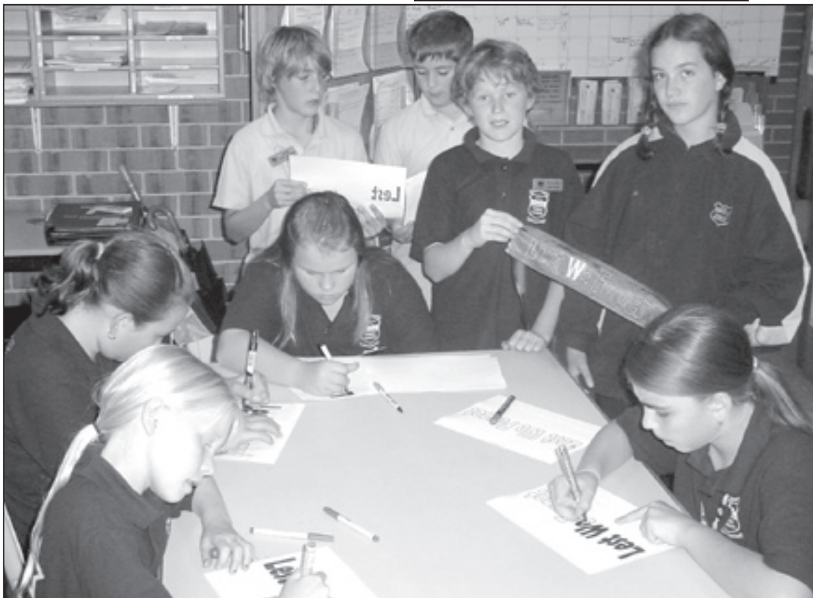
Students at Ettalong Public School building a wreath for Anzac Day

Press release, April 14 Jack Carney, Woy Woy Ettalong-Hardys Bay Sub Branch