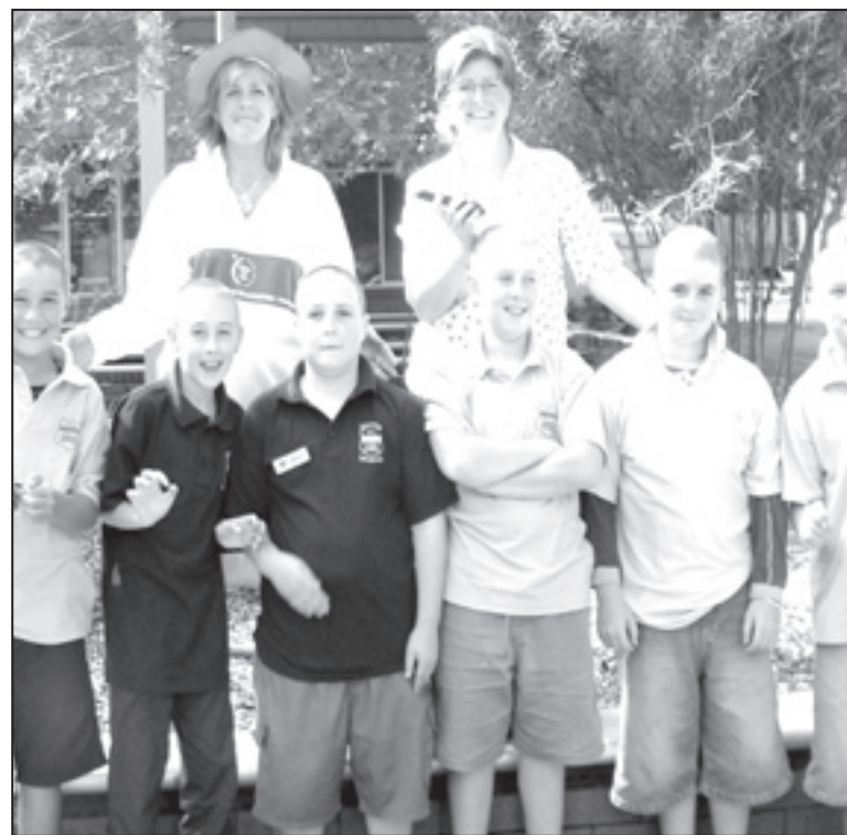
The Ettalong Public School students who shaved their heads in support of cancer research