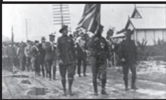
ANZAC Day March, Woy Woy 1923