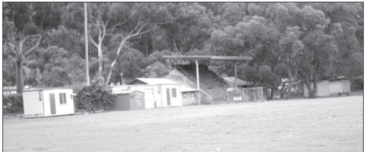
The grand stand at Ettalong Oval, surrounded by security fencing after a recent fire