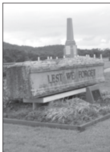
Woy Woy Memorial