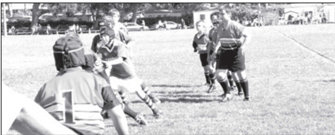
Kariong played Noth Lakes in an under 11 rugby union match played at Ettalong Oval, on April 15