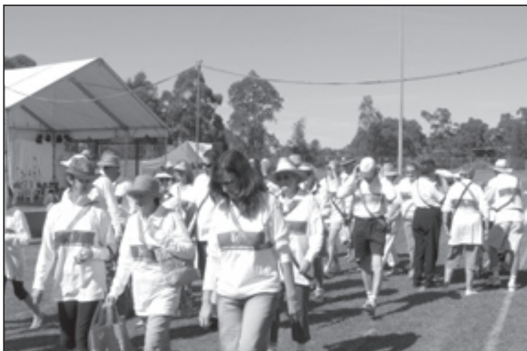
Walkers at the Peninsula Relay for Life