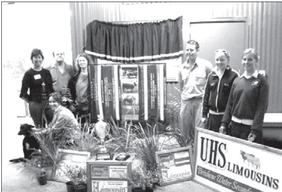
Brisbane Water Secondary College parents, teachers and students displayed Cattle Club ribbons and trophies won in Term 1 by college students at a P&C appreciation Barbecue