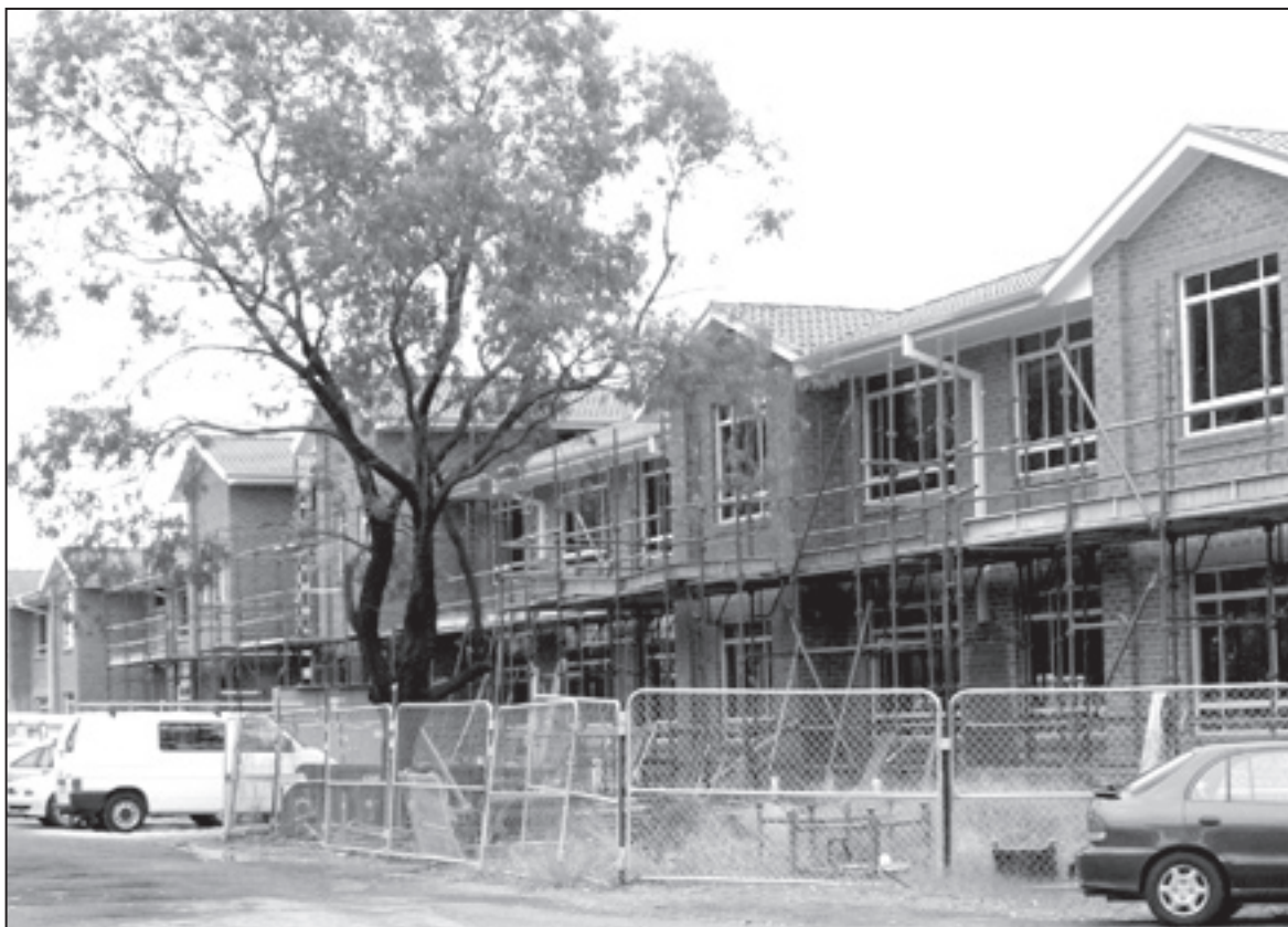
Construction underway at the Peninsula Village Retirement Centre