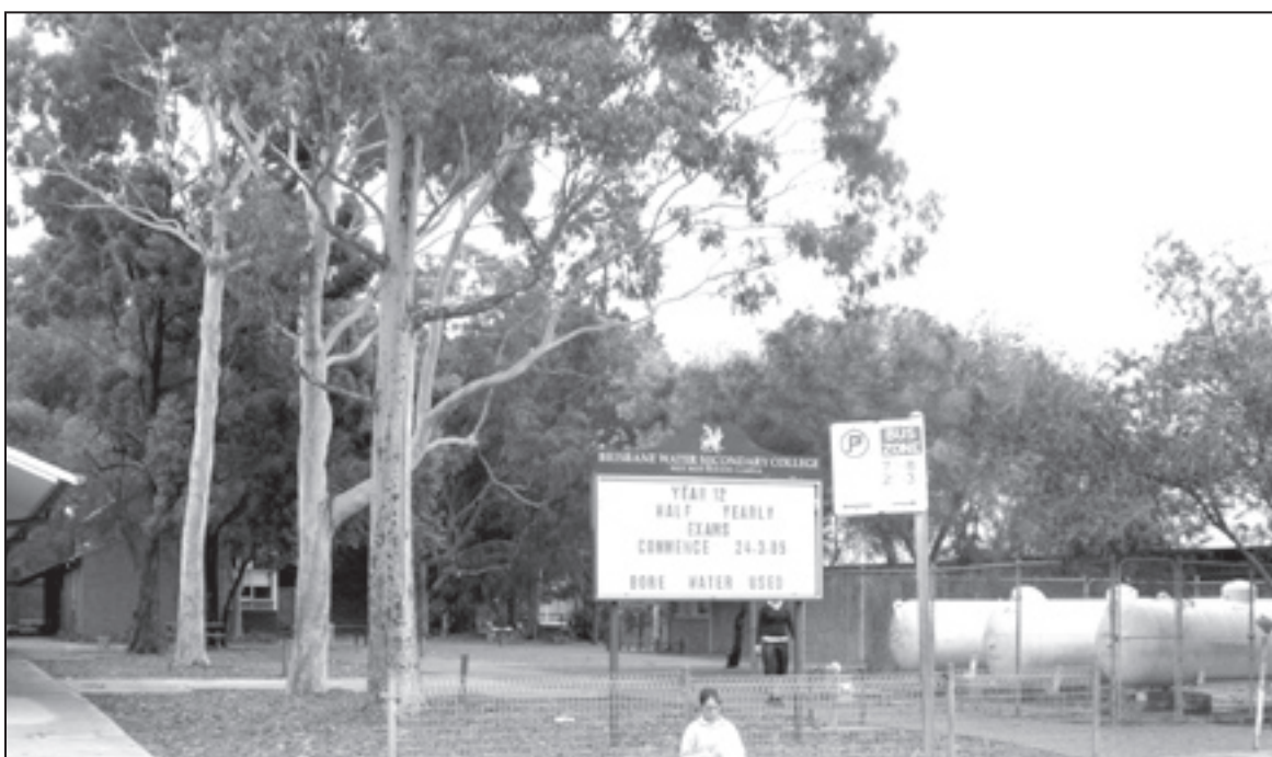
Brisbane Water Secondary College, Woy Woy