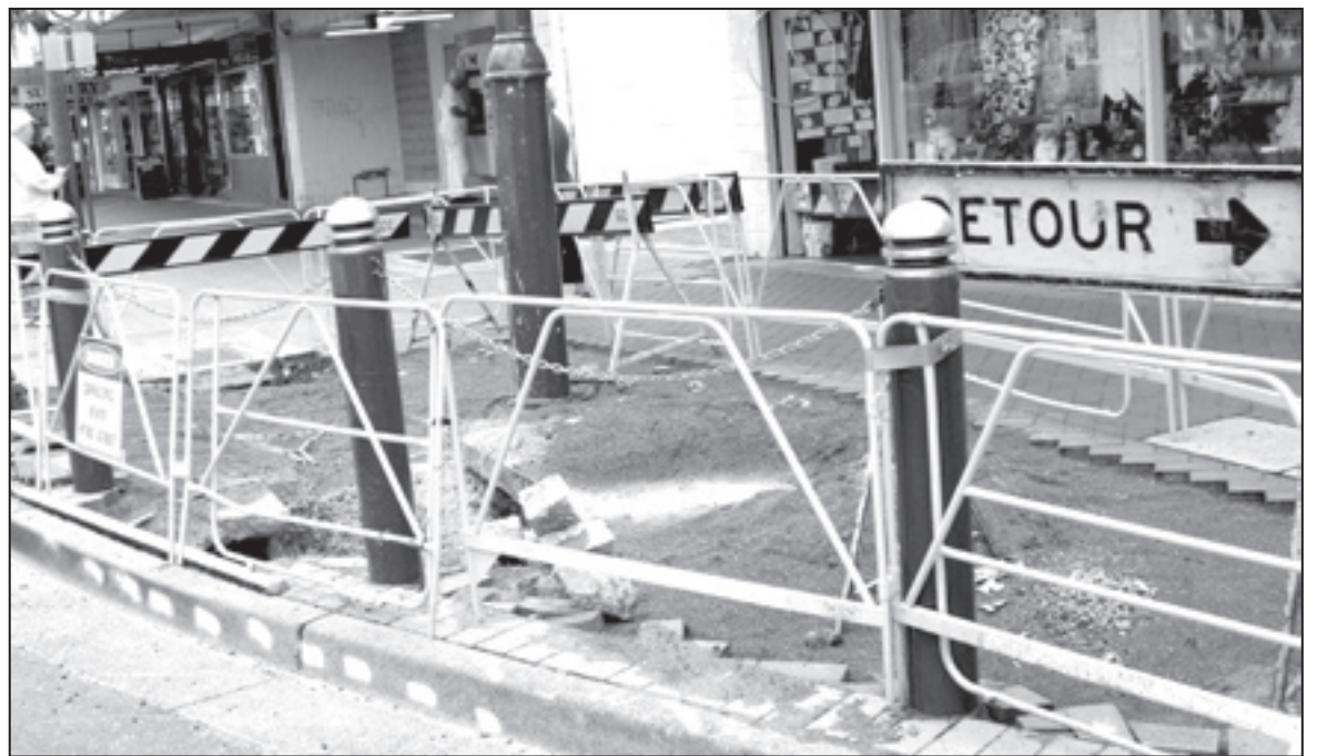
Upgrading work in progress at the West St pedestrian crossing