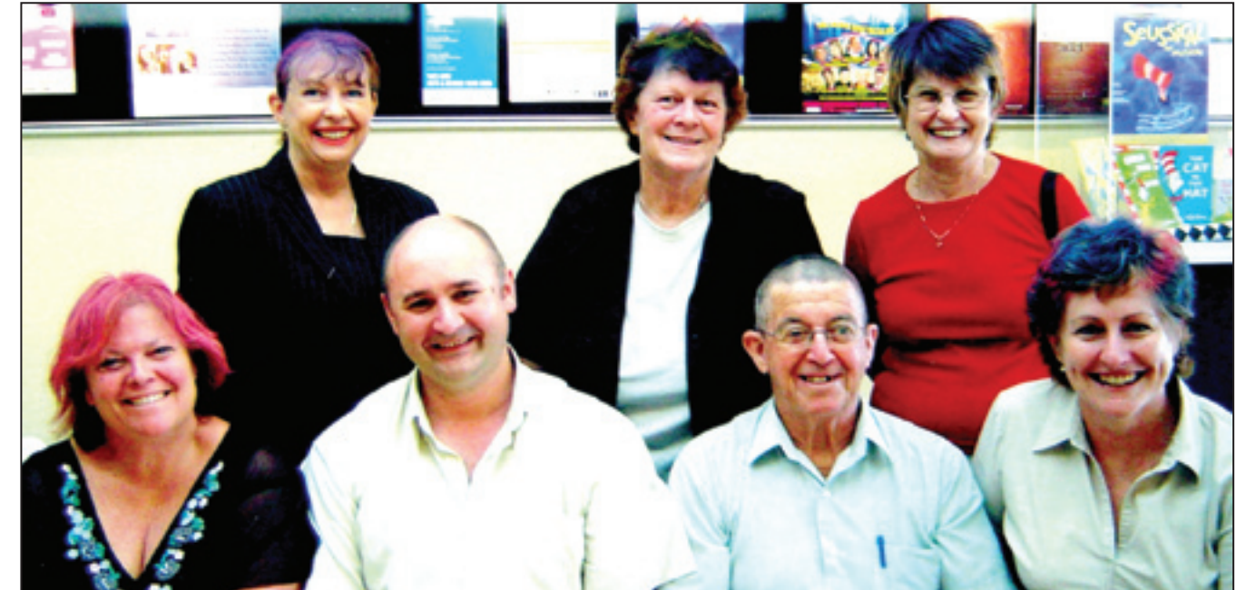
Members from Woy Woy Little Theatre, Laycock St Theatre, Wyong Drama Group and Gosford Musical Society who between them raised more than $1000 on behalf of Shave for a Cure