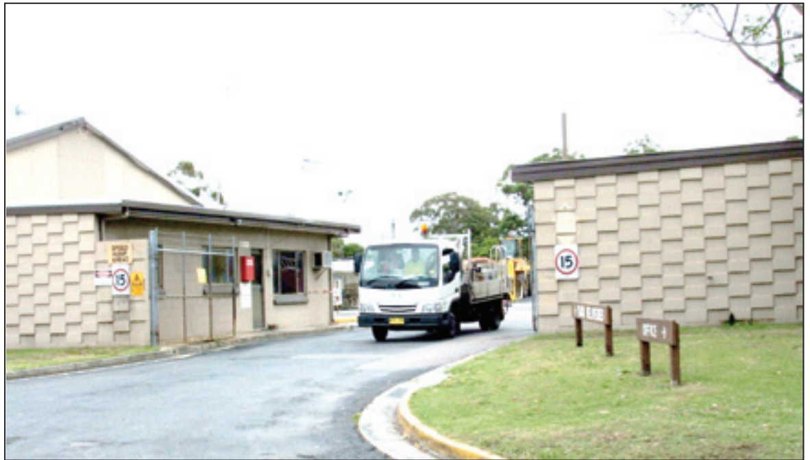
Gosford City Council's depot at Woy Woy: Site of the proposed groundwater treatment plant

Page 7: Community loses voice Facts and figures