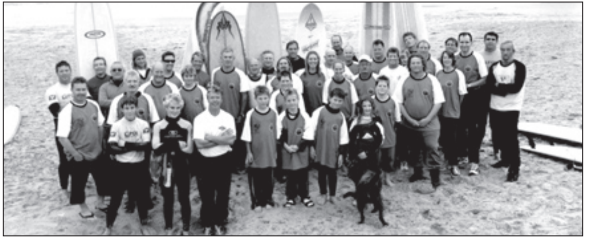
Members of the Ocean Beach Malibu Club