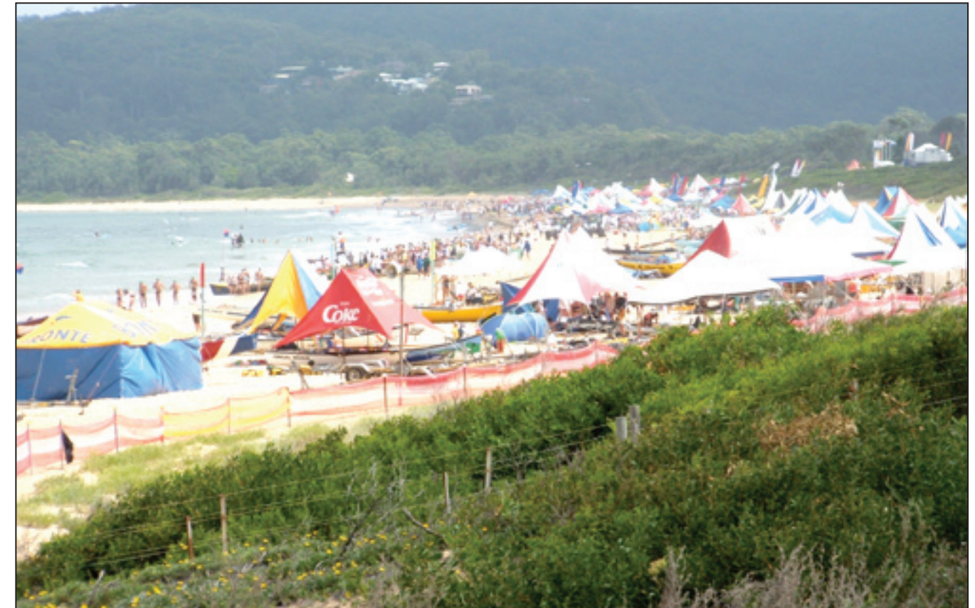
The Masters competition underway at the NSW Surf Life Saving Championships on March 4