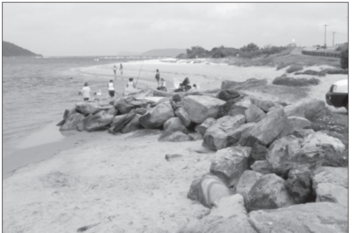
Families enjoying the Ettalong foreshore