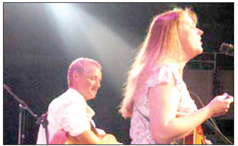
Acoustic duo Us Not Them