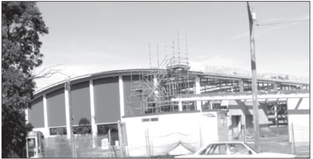
The nearly completed roof of the Regional Lesiure Centre

Press release, March 4 Ian Hanson, Hanson Sports Media