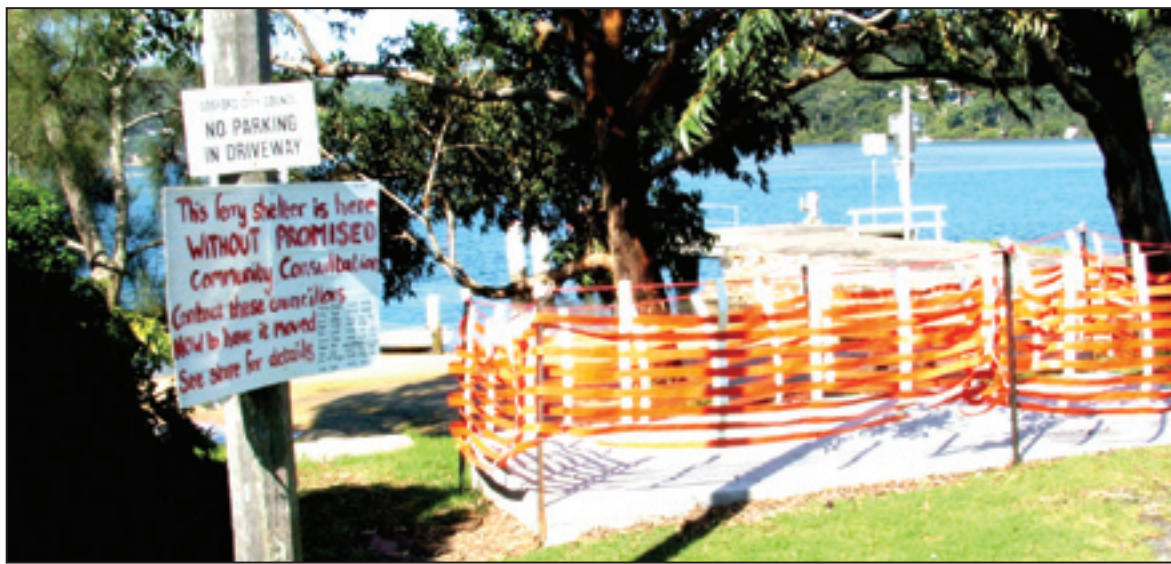
Disgruntled residents erected a sign protesting against the siting of the new ferry shelter