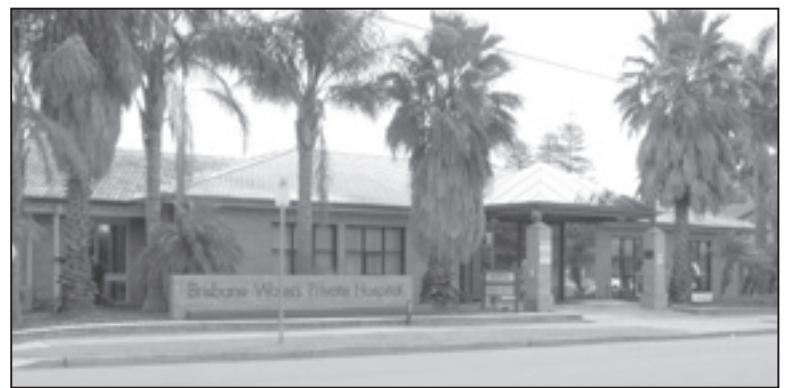
Brisbane Waters Private Hospital

Press release, February 25 Ettalong Markets