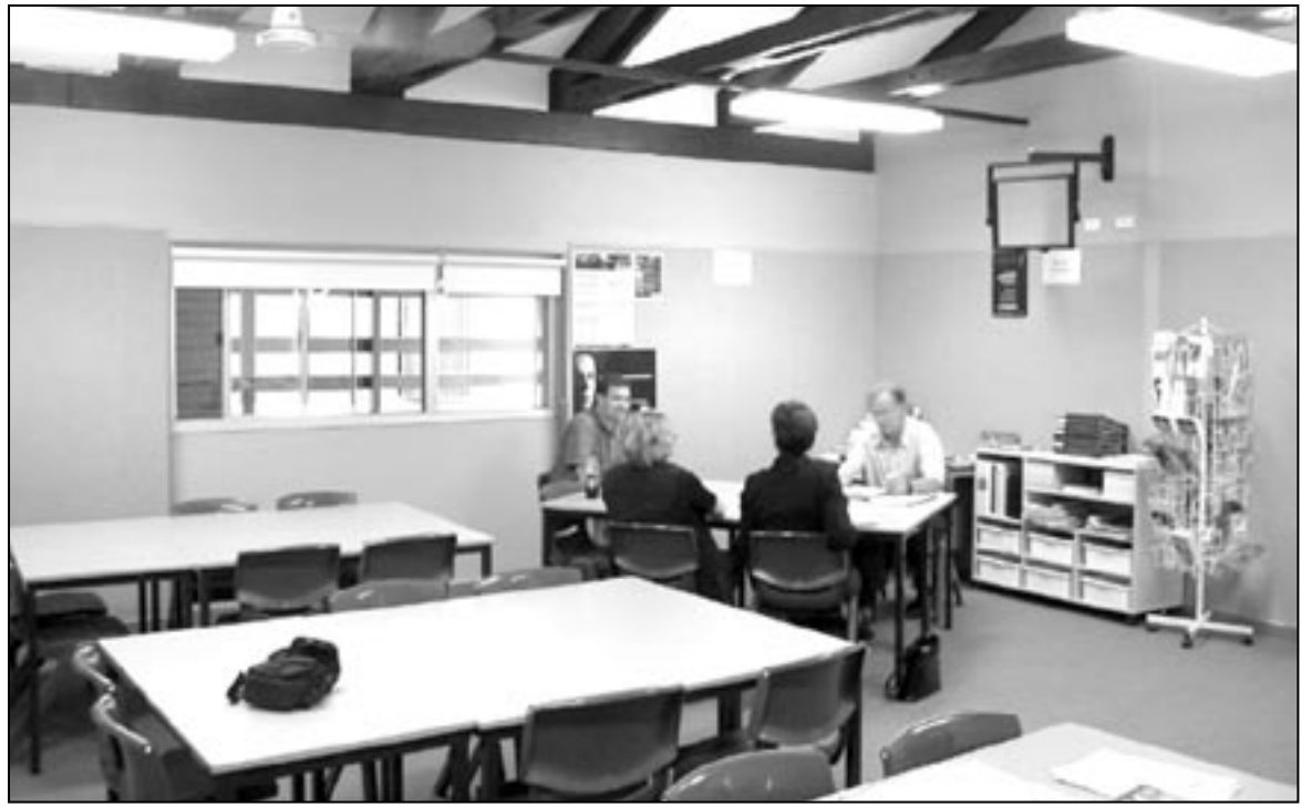
One of the newly completed buildings at Brisbane Water Secondary College

Press release, February 3 Pat Lewis, Brisbane Water Secondary College