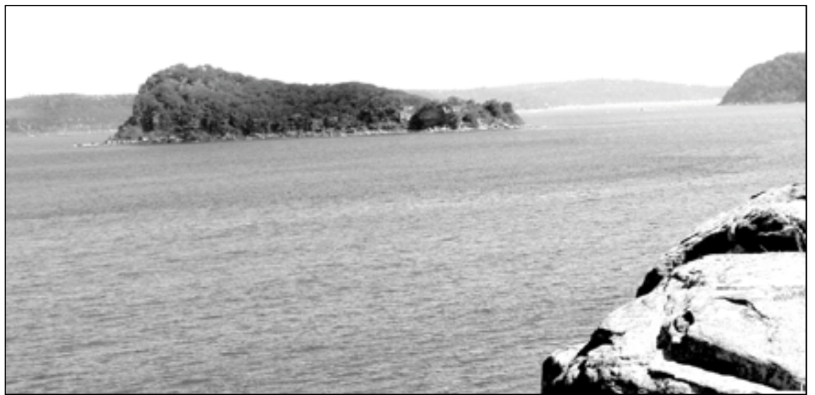
Broken Bay with Lion Island in the foreground