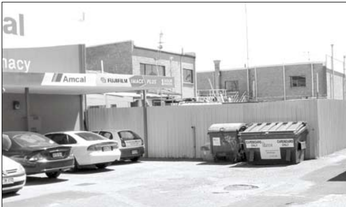
The site of the proposed medical centre to incorporate the present Amcal Pharmacy at Umina