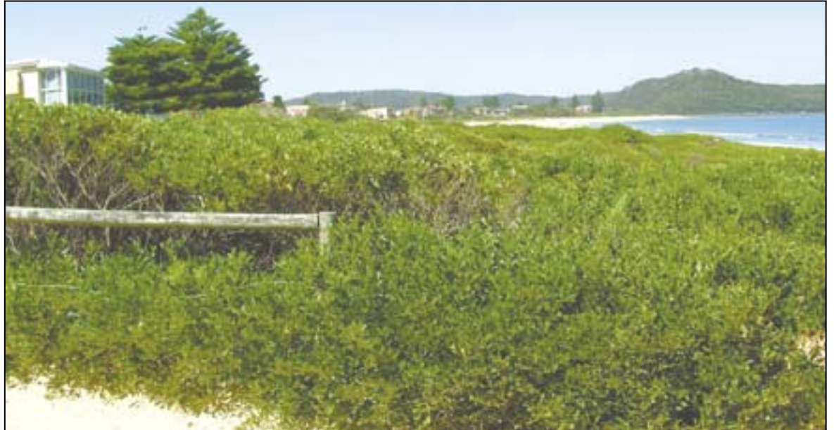
Dune vegetation at Umina Beach Surf Club blocking views of the beach

Press release, February 4 Cec Bucello, Woy Woy Australia Day Committee