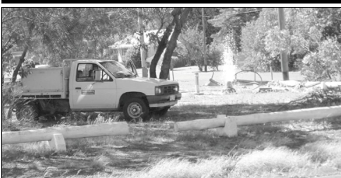
Contractors engaged by the Wyong-Gosford waterboard test usability of ground water in Rogers Park, Woy Woy