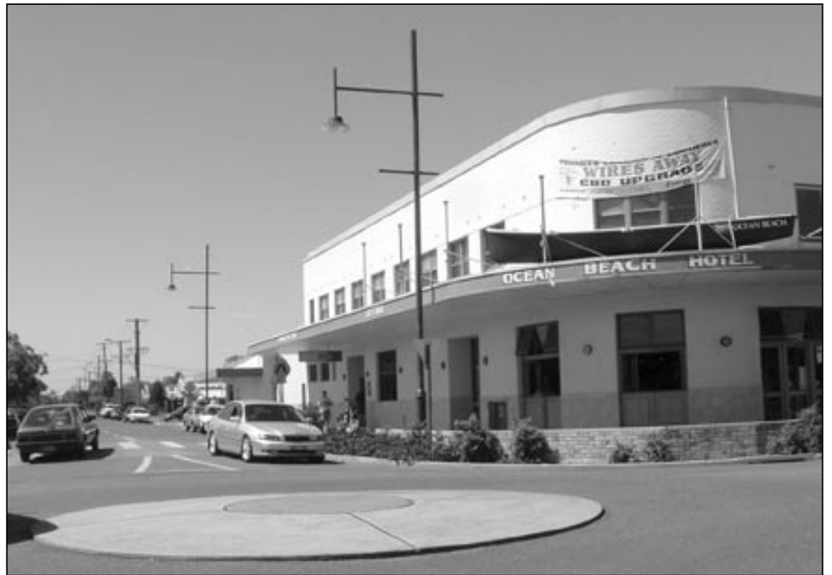
The 'Wires Away' banner hanging outside the Ocean Beach Hotel, where overhead wires have recently been removed