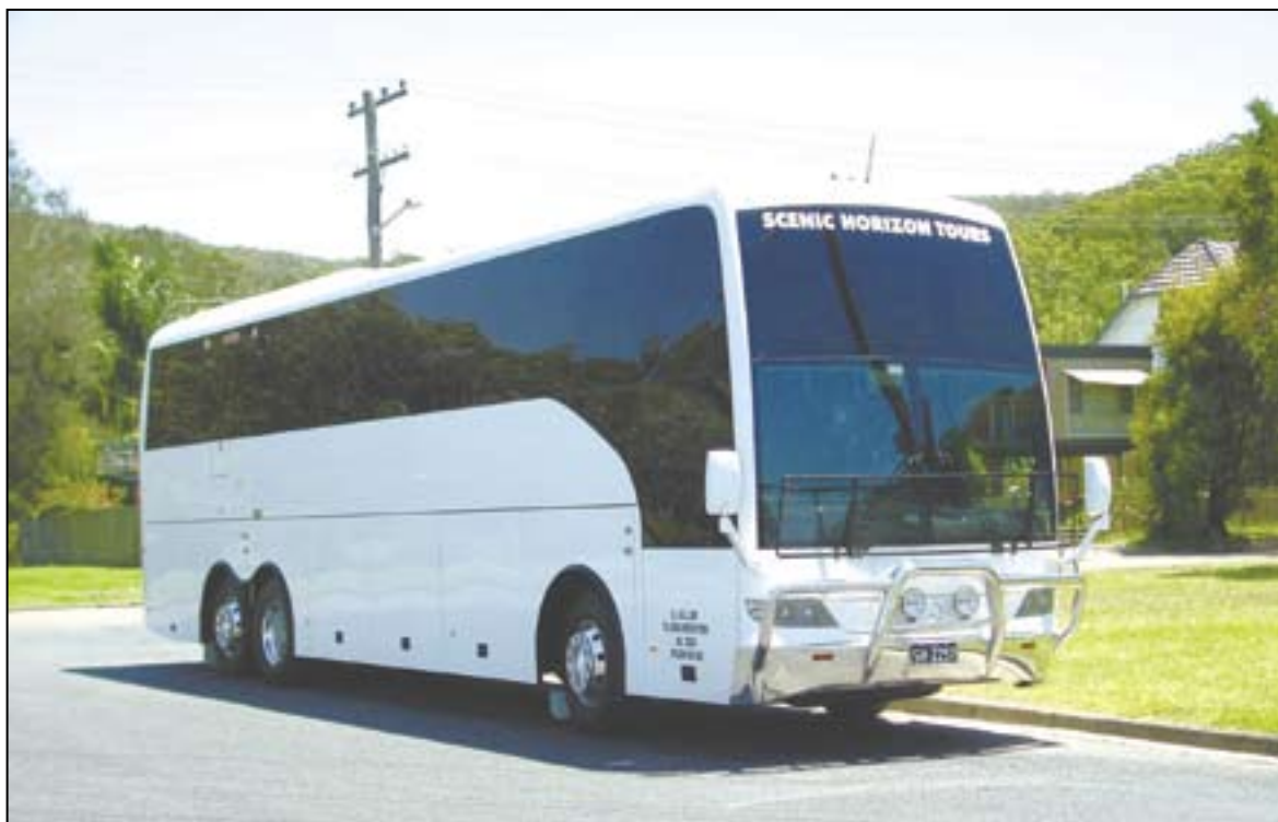
The new Scenic Horizon Tour coach