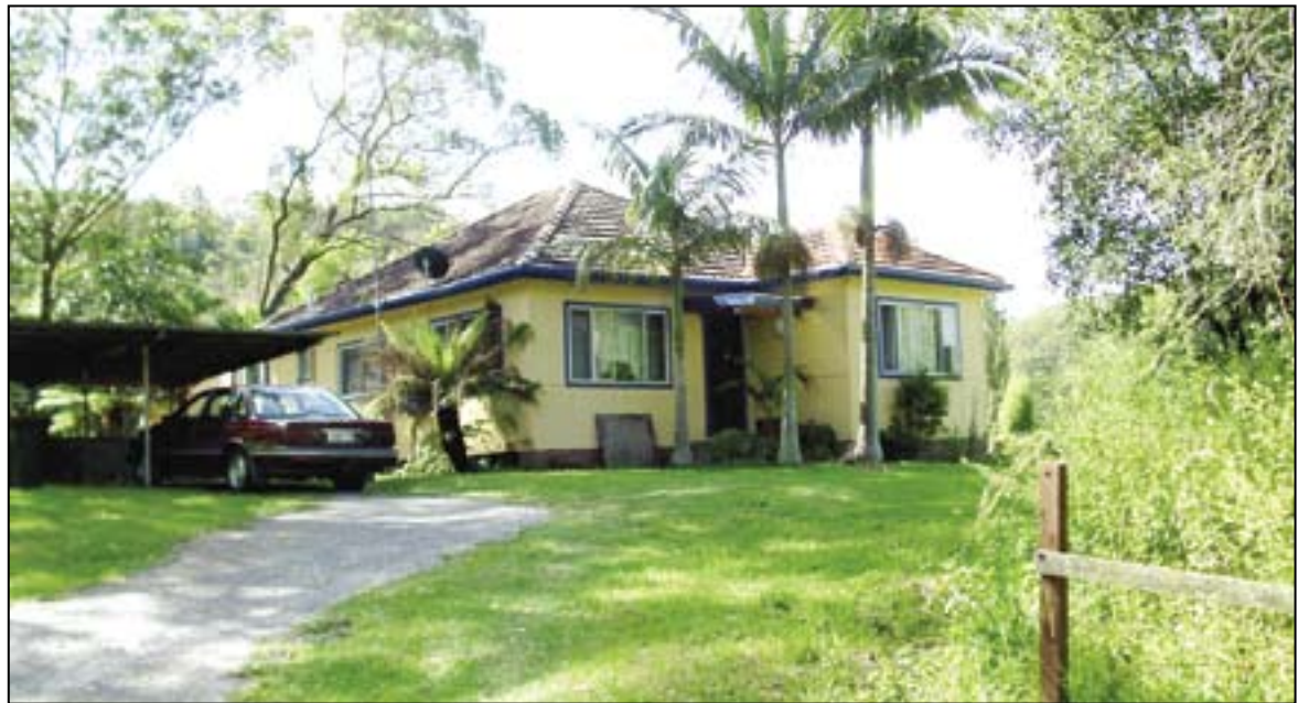
The cottage on Woy Woy Rd