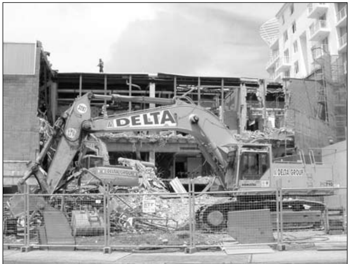
The former Ettalong Memorial Club being demolished