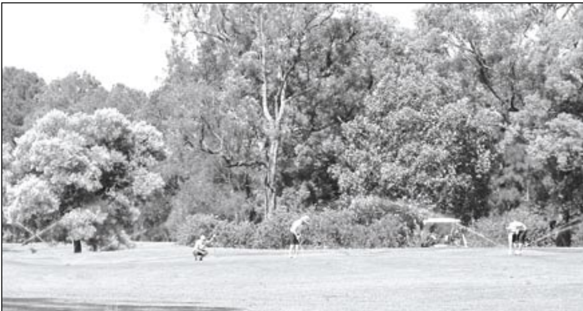
The Everglades Country Club sprinkler system watering the golf course

"Unfortunately, because we have not been able to deliver water to the course consistently since last October, the damage has been