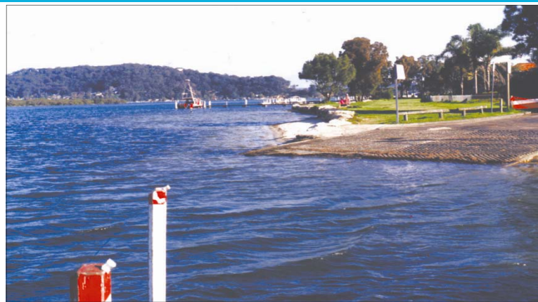
Correa Bay boat ramp