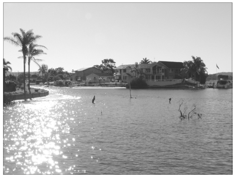
An canal at St Hubert's Island