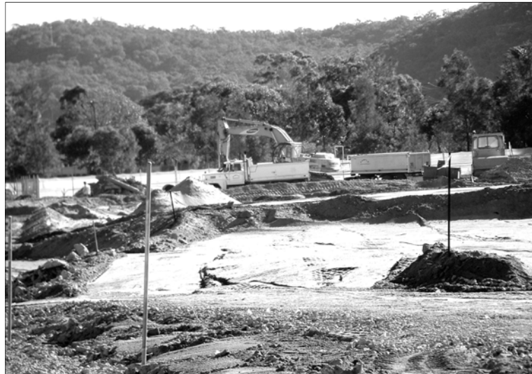
Construction is underway on the Peninsula Leisure Centre site

"We're expecting that we will open a month before the swimming season next year, giving us time to train staff."