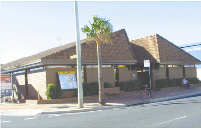
Rebuilding or refurbishing Umina Library is currently being investigated by Council staff