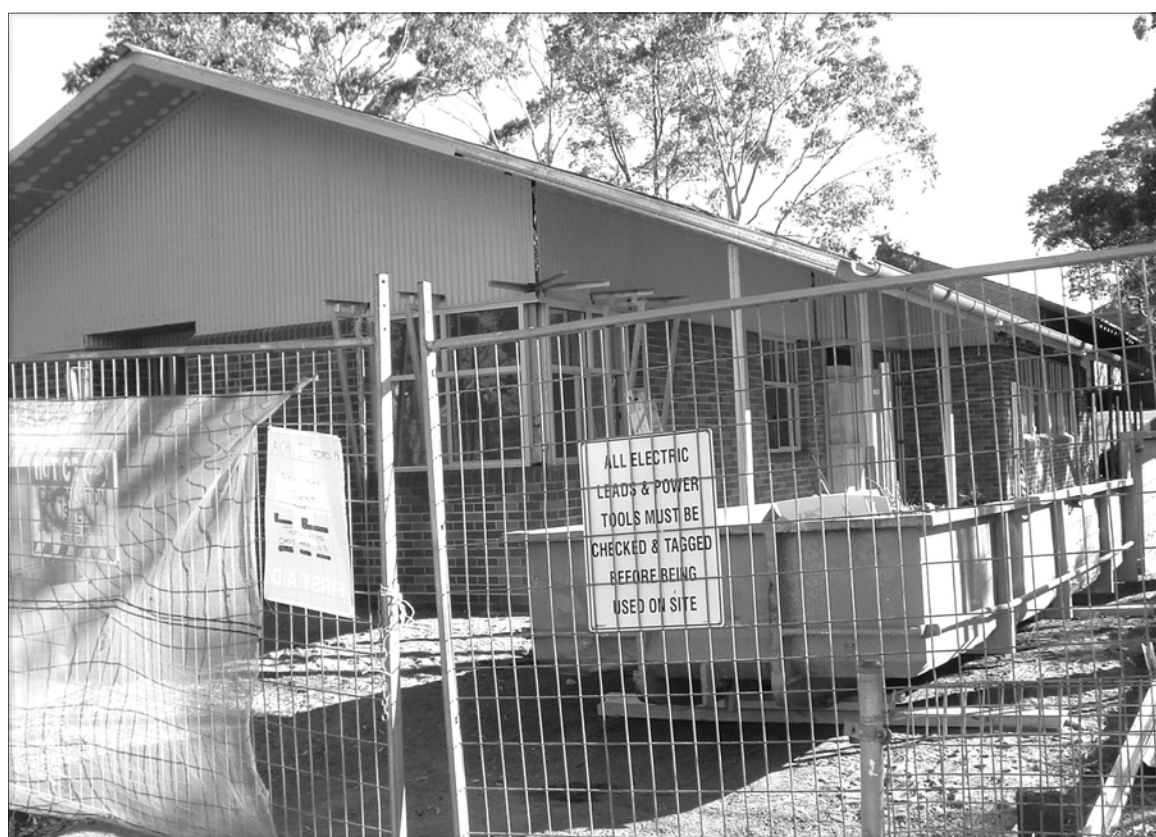
Construction currently underway at the Woy Woy Campus of Brisbane Water Secondary College

Project costs will be announced once the tender has been awarded - ensuring better value