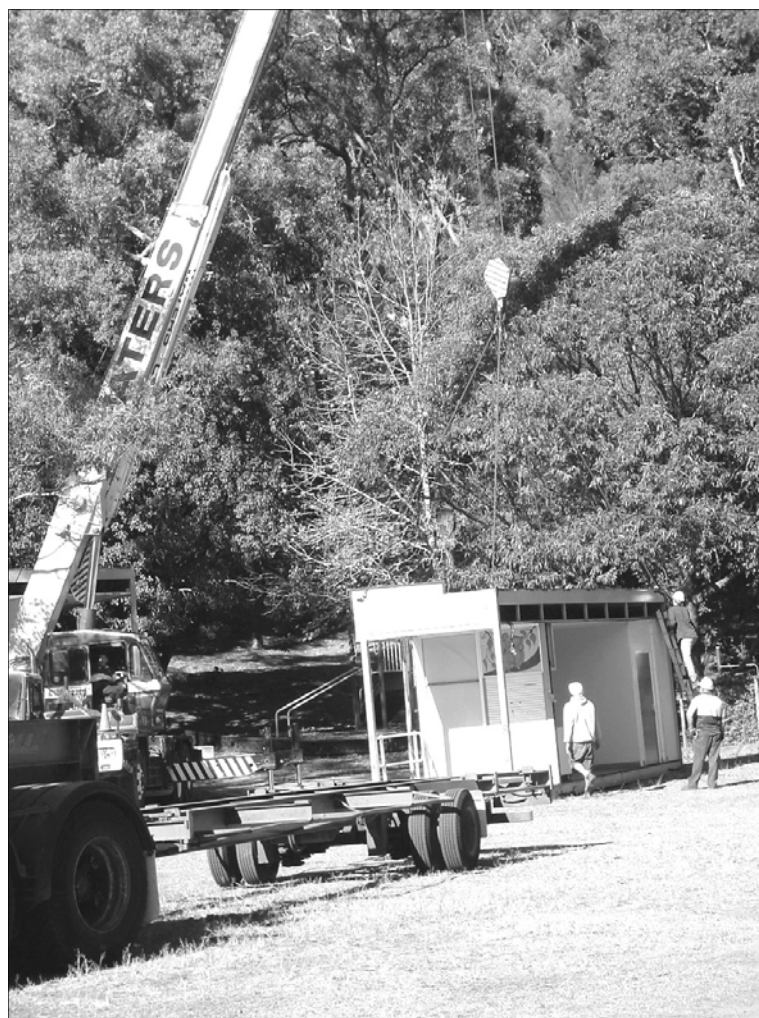
Pretty Beach Public School received their new school canteen by crane on June 16