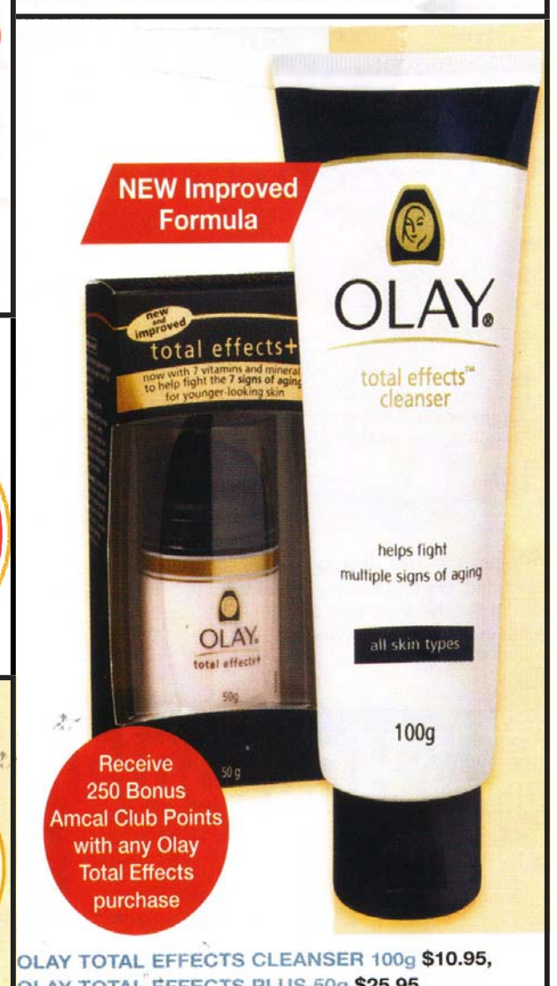
OLAY TOTAL EFFECTS CLEANSER 100g $10.95, OLAY TOTAL EFFECTS PLUS 50g $25.95

Shop 4, Peninsula Plaza Woy Woy Ph: 4342 2256