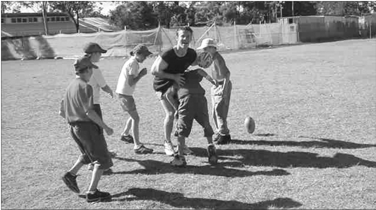
Students from BWSC put Woy Woy South kids through their paces