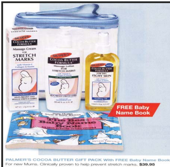
PALMER'S COCOA BUTTER GIFT PACK With FREE Baby Name Book For new Mums. Clinically proven to help prevent stretch marks. $39.95

Next time you're filling in a script, ask us if there is an Alphapharm brand of your medication - and save.