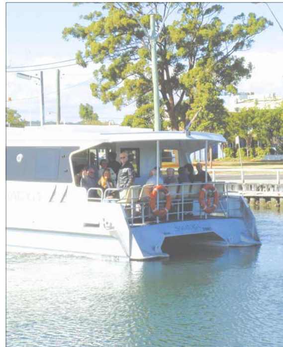
The carers took the ferry trip to Davistown to celebrate their first year of operation