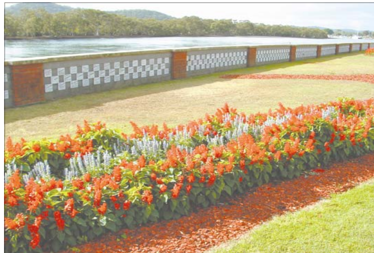
The existing Memorial Wall at Woy Woy