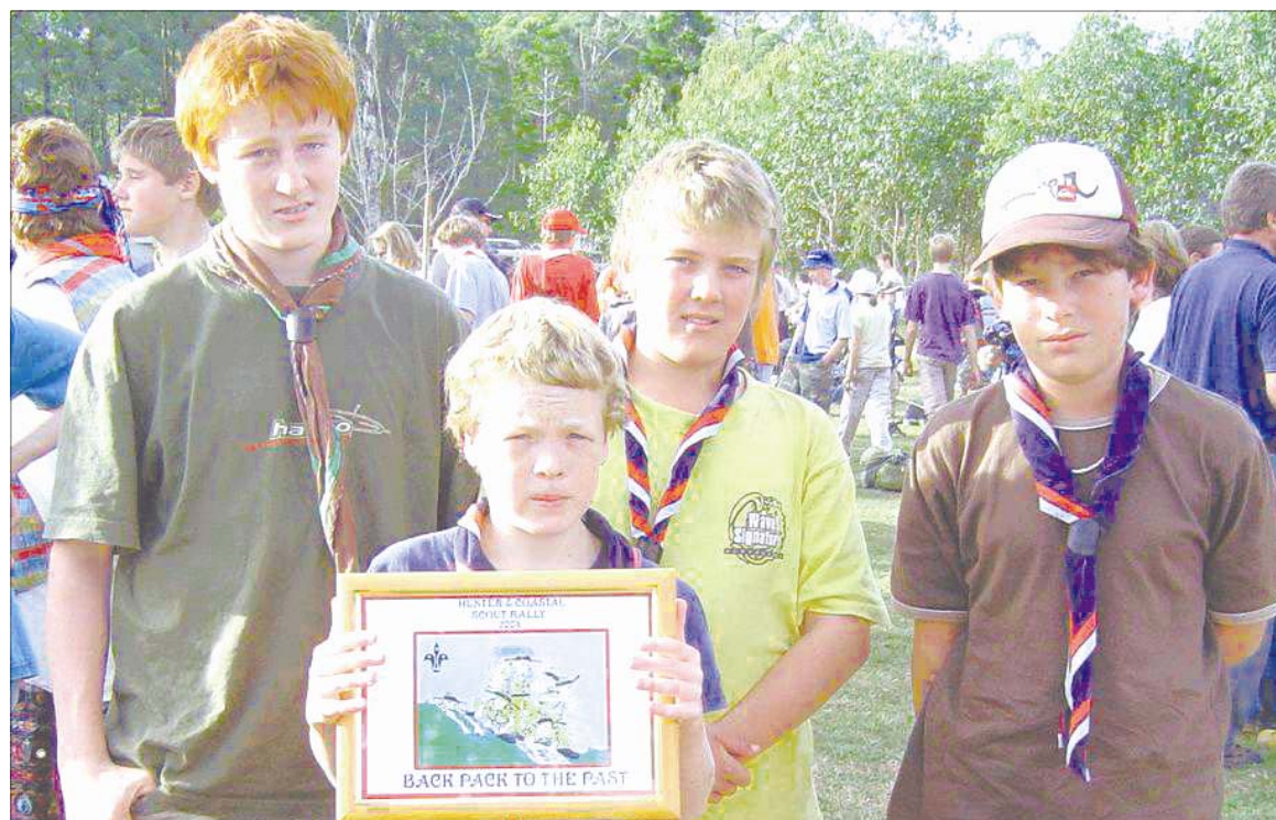
at Cataract Scout Park in August," he said.

"Their outstanding achievement has earned the troop from Umina the opportunity to attend the State Rally to be held