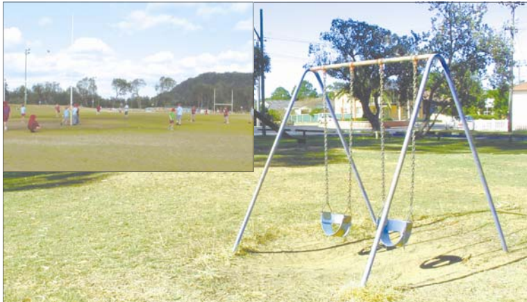
Public parks and playgrounds will benefit from Contributions Plan funding