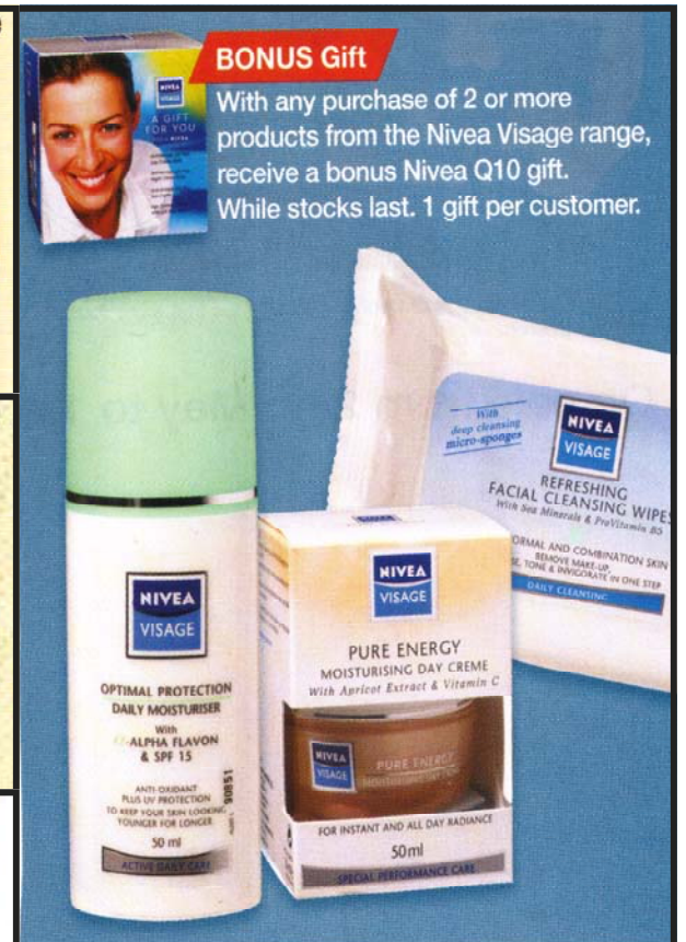
NIVEA VISAGE OPTIMAL PROTECTION 50mL $11.95, NIVEA VISAGE PURE ENERGY 50mL $11.95, NIVEA VISAGE FACIAL CLEANSING WIPES $5.95