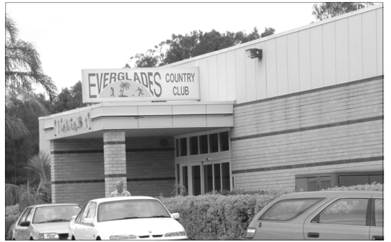
Everglades Country Club

They are Woy Woy Leagues Club, Woy Woy Bowling Club, Everglades Bowling Club, Club Umina, the Ettalong Memorial