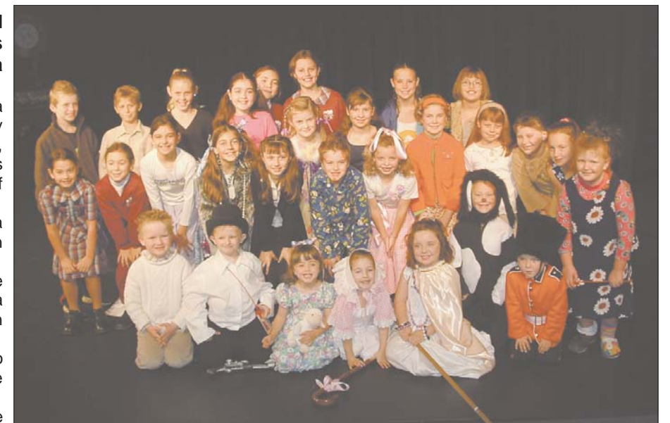
Junior performers from various Drama and Dance Schools prepared for their performances

nursery rhymes in costume on Friday morning, and older students prepared monologues and characterisations later in the day.